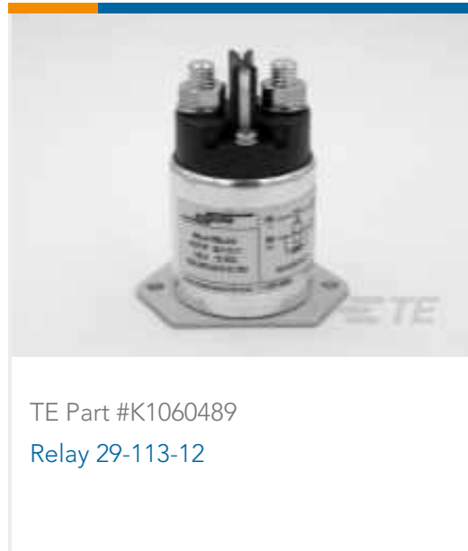
TE Part #K1060489 Relay 29-113-12