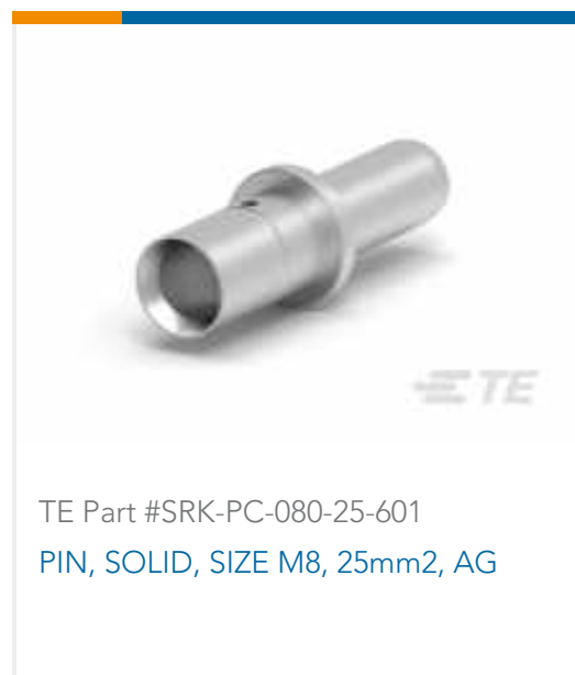
TE Part #SRK-PC-080-25-601 PIN, SOLID, SIZE M8, 25mm2, AG