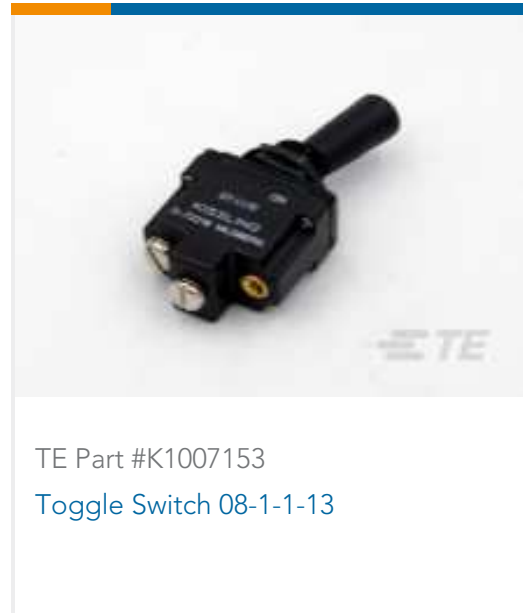
TE Part #K1007153 Toggle Switch 08-1-1-13