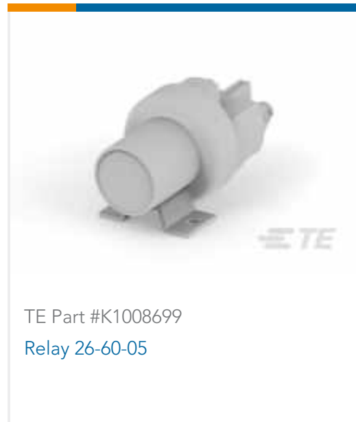
TE Part #K1008699 Relay 26-60-05