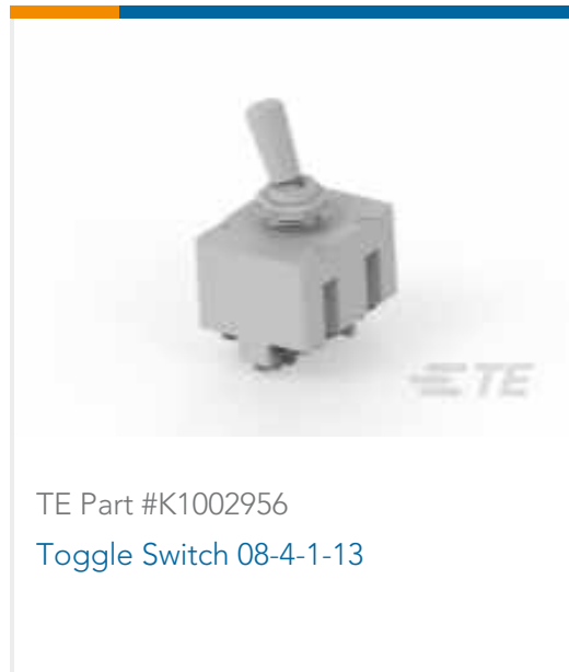
TE Part #K1002956 Toggle Switch 08-4-1-13