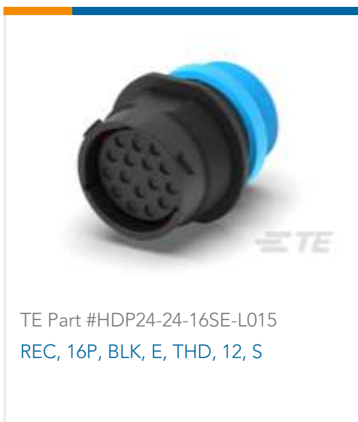
TE Part #HDP24-24-16SE-L015 REC, 16P, BLK, E, THD, 12, S