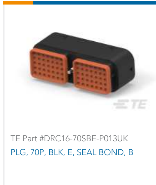
TE Part #DRC16-70SBE-P013UK PLG, 70P, BLK, E, SEAL BOND, B