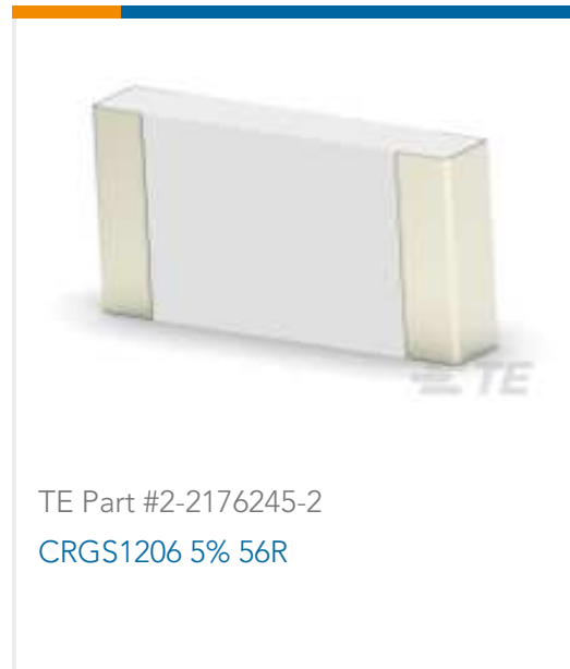
TE Part #2-2176245-2 CRGS1206 5% 56R