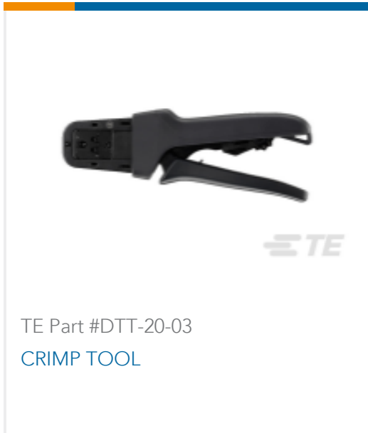
TE Part #DTT-20-03 CRIMP TOOL