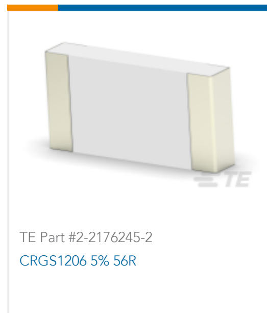
TE Part #2-2176245-2 CRGS1206 5% 56R