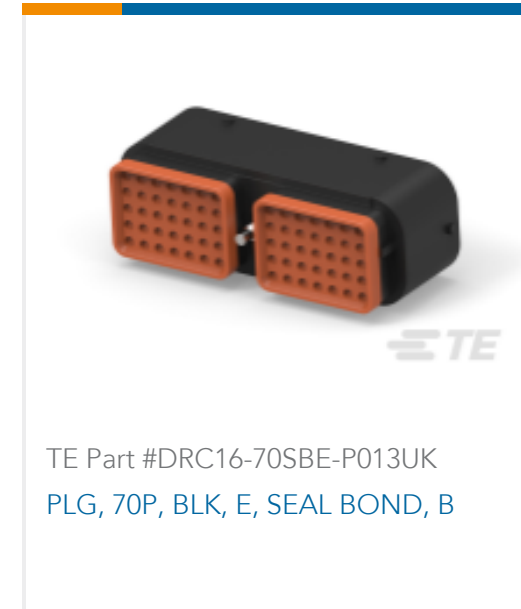
TE Part #DRC16-70SBE-P013UK PLG, 70P, BLK, E, SEAL BOND, B