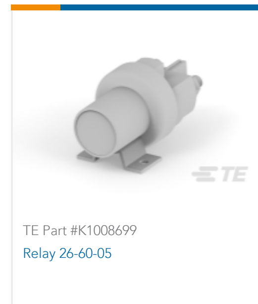
TE Part #K1008699 Relay 26-60-05