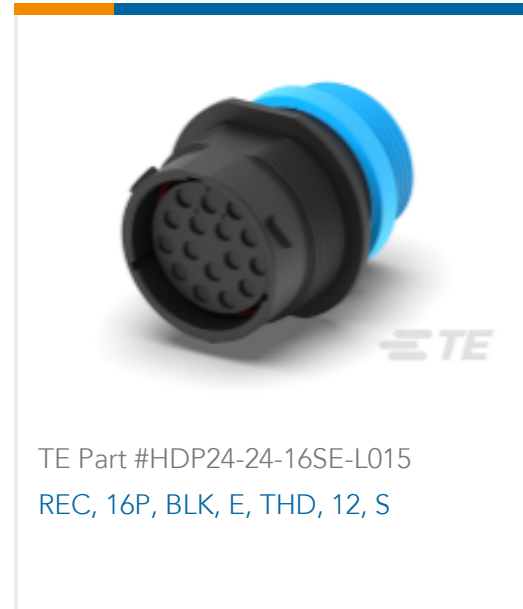
TE Part #HDP24-24-16SE-L015 REC, 16P, BLK, E, THD, 12, S