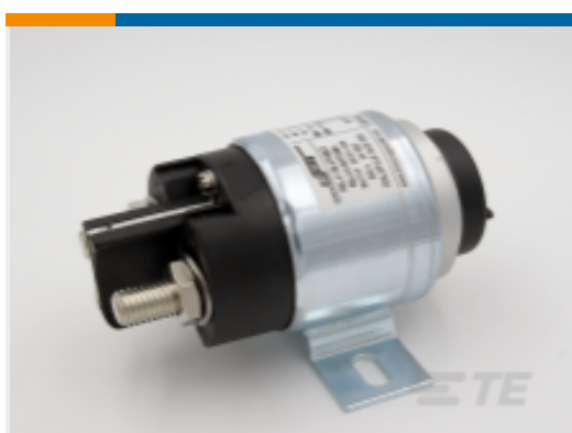
TE Part # CAT-AL6-KSPR30500 Power Relay, 500A, Standard, Bistable, 2 Coils, Polarized