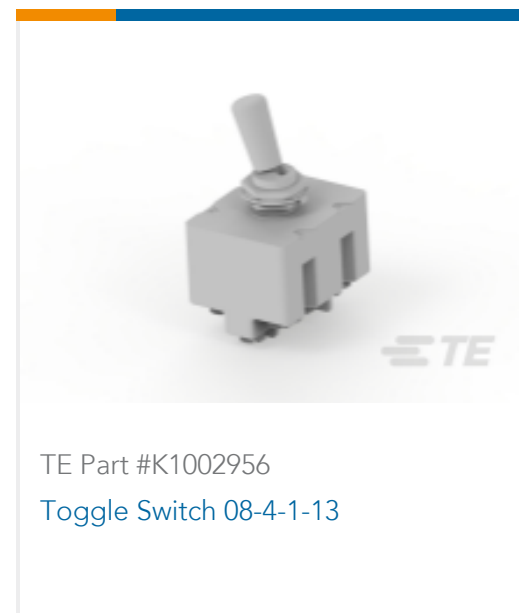
TE Part #K1002956 Toggle Switch 08-4-1-13