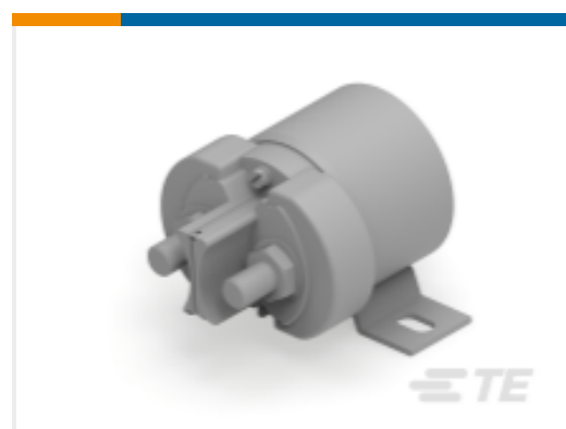
TE Part # K1146241 Bi-Relais 500A 24V S-FL LK 30-511-12B