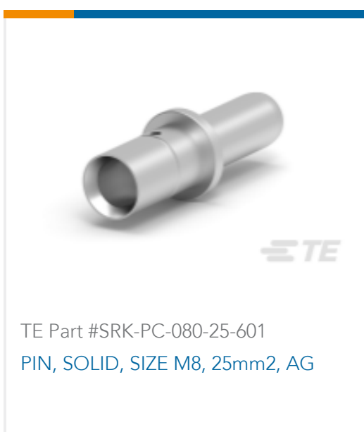
TE Part #SRK-PC-080-25-601 PIN, SOLID, SIZE M8, 25mm2, AG