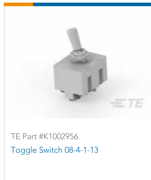
TE Part #K1002956 Toggle Switch 08-4-1-13