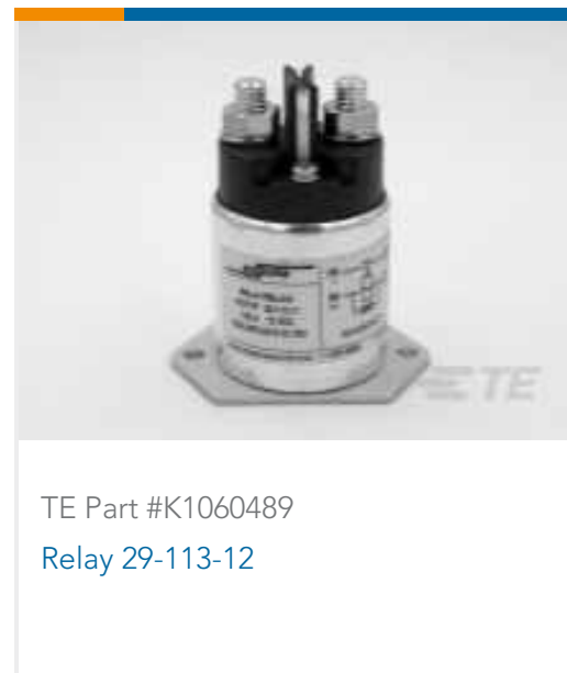
TE Part #K1060489 Relay 29-113-12