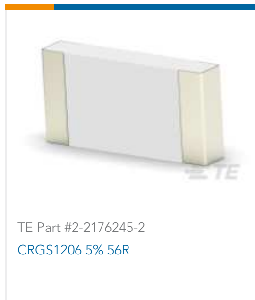
TE Part #2-2176245-2 CRGS1206 5% 56R