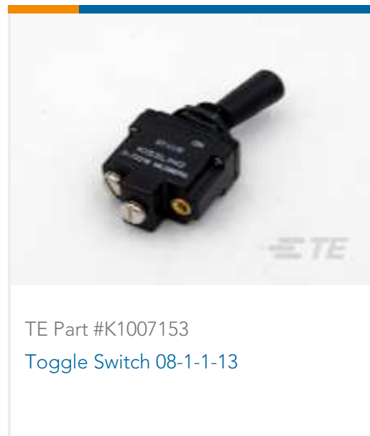
TE Part #K1007153 Toggle Switch 08-1-1-13