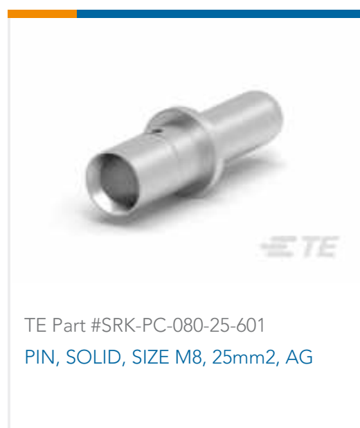
TE Part #SRK-PC-080-25-601 PIN, SOLID, SIZE M8, 25mm2, AG