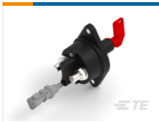
TE Part # CAT-AL4-SBD355001 Battery Disconnecter, 500A, 1 Pole