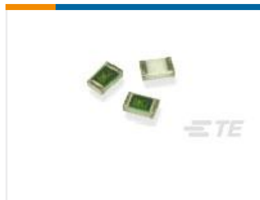
TE Part #2-1879129-5 RN 0402 1K47 0.1% 10PPM CUT LENGTH