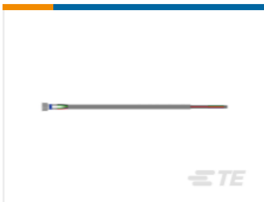
TE Part #2317659-9 AV25 DPM 3A MOVING RING POWER R&G 12V FL