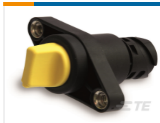
TE Part # CAT-AL8-KSDRSS Rotary Switch, Socket, Short Handle Selector, Sealed