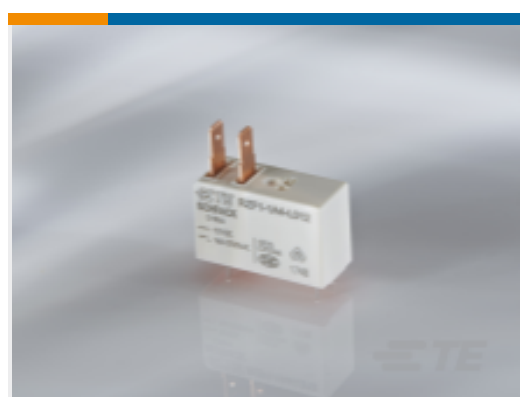
TE Part #1833011-5 RZF1-1A4-L018