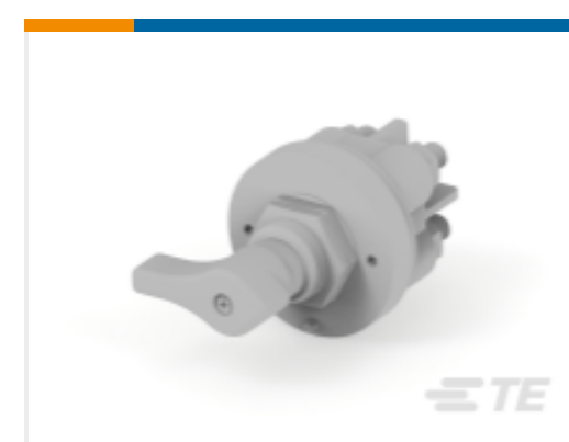
TE Part # K1127651 Battery Disconnecter 35-323-151-R