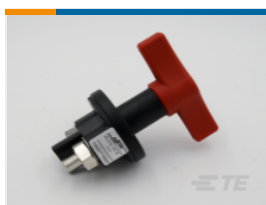
TE Part # CAT-AL4-SBD352001 Battery Disconnecter, 200A, 1 Pole