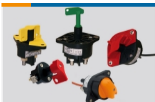
Battery Disconnect Switches(165)