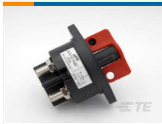
TE Part # CAT-AL4-SBD355002 Battery Disconnecter, 500A, 2 Pole