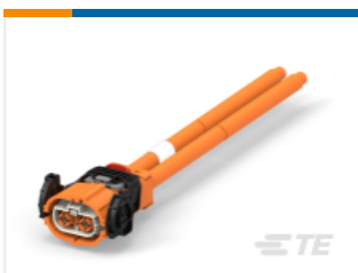
TE Part #1-2286937-5 2POS,HVP800,180 DEG,50 SQMM, COD A,CS