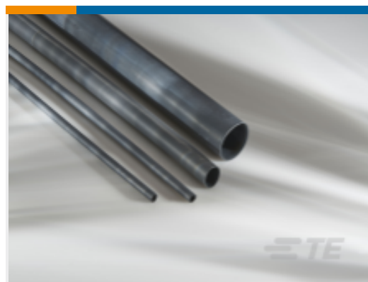
TE Part #EH2294-000 DWFR-40/13-0-STK