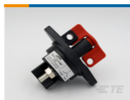
TE Part # CAT-AL4-SBD353001 Battery Disconnecter, 300A, 1 Pole