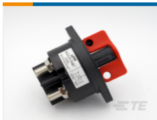
TE Part #K1137217 Battery Disconnecter 35-524-231-R-900