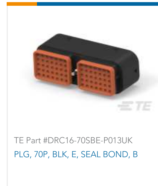
TE Part #DRC16-70SBE-P013UK PLG, 70P, BLK, E, SEAL BOND, B