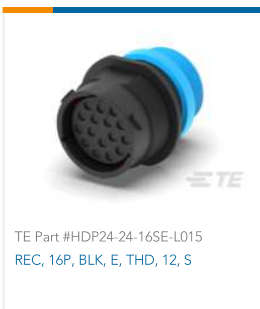
TE Part #HDP24-24-16SE-L015 REC, 16P, BLK, E, THD, 12, S