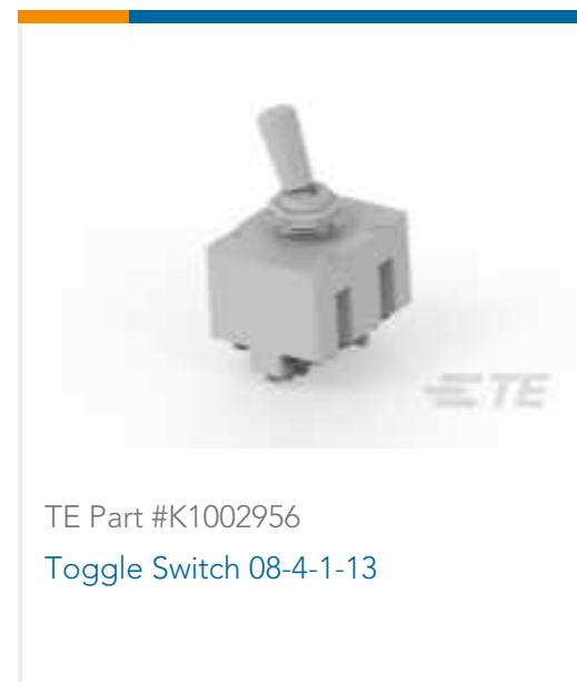
TE Part #K1002956 Toggle Switch 08-4-1-13