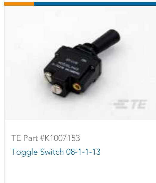
TE Part #K1007153 Toggle Switch 08-1-1-13