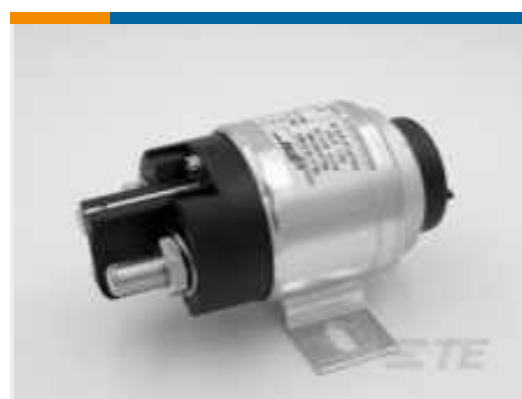
TE Part # CAT-AL6-KSPR30500 Power Relay, 500A, Standard, Bistable, 2 Coils, Polarized