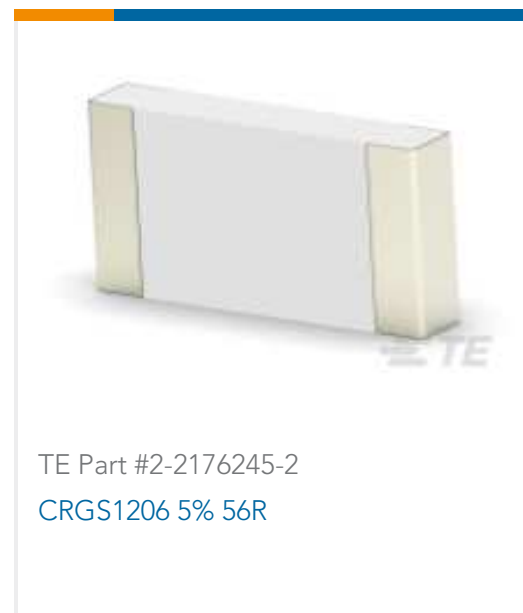
TE Part #2-2176245-2 CRGS1206 5% 56R