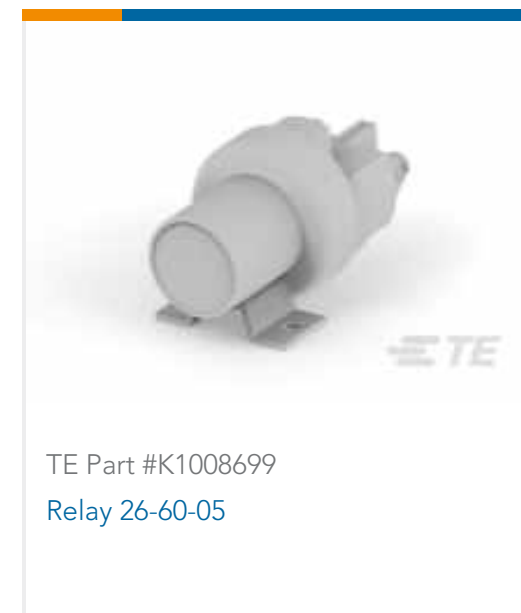
TE Part #K1008699 Relay 26-60-05