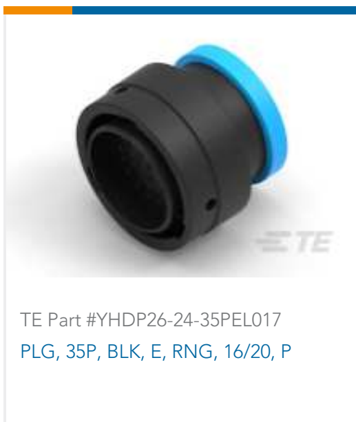
TE Part #YHDP26-24-35PEL017 PLG, 35P, BLK, E, RNG, 16/20, P