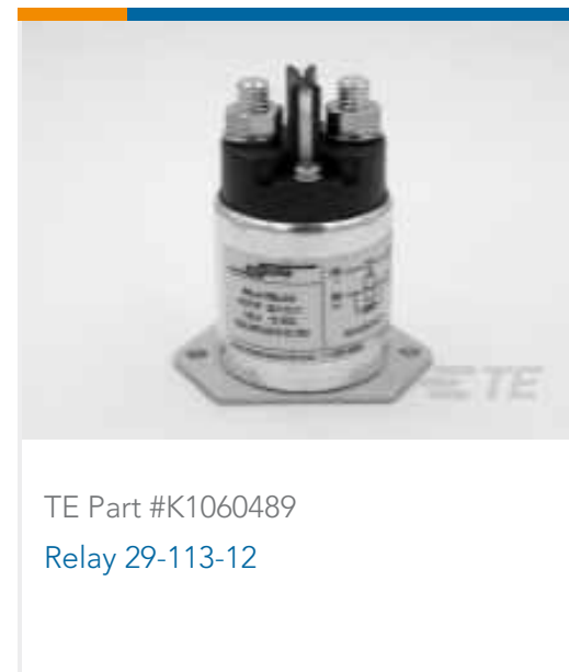
TE Part #K1060489 Relay 29-113-12