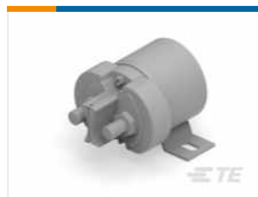
TE Part # K1146241 Bi-Relais 500A 24V S-FL LK 30-511-12B