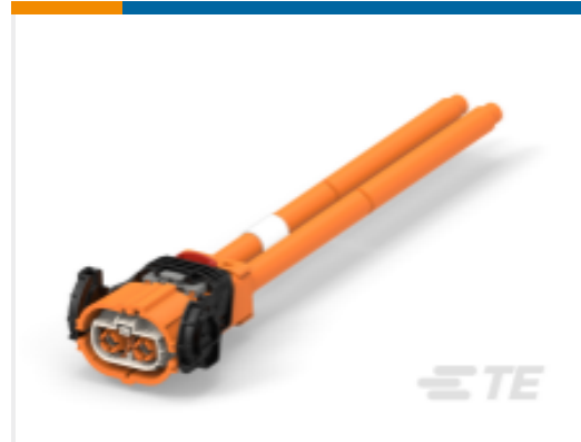
TE Part #1-2286937-5 2POS,HVP800,180 DEG,50 SQMM, COD A,CS