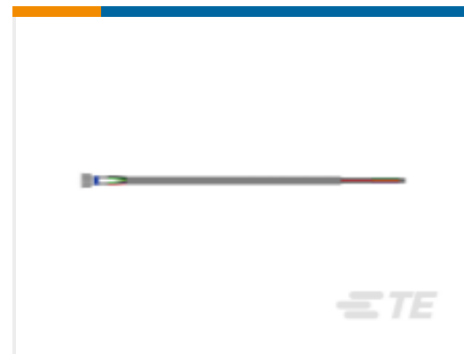
TE Part #2317659-9 AV25 DPM 3A MOVING RING POWER R&G 12V FL