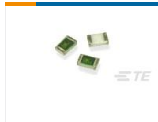
TE Part #2-1879129-5 RN 0402 1K47 0.1% 10PPM CUT LENGTH