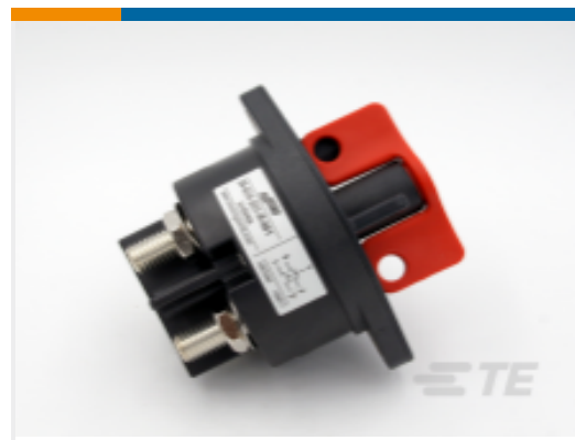
TE Part #K1137217 Battery Disconnecter 35-524-231-R-900