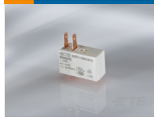
TE Part #1833011-5 RZF1-1A4-L018