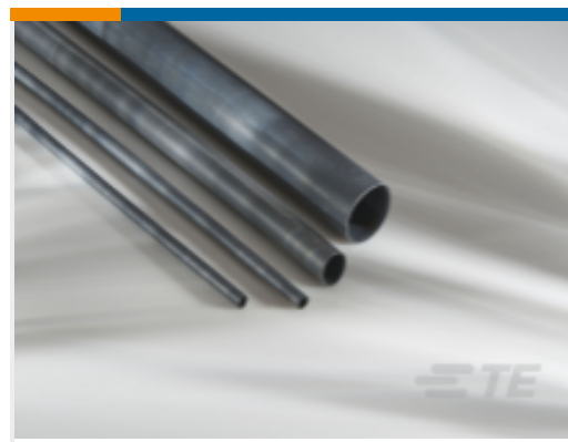
TE Part #EH2294-000 DWFR-40/13-0-STK