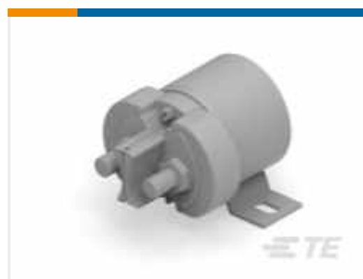
TE Part # K1146241 Bi-Relais 500A 24V S-FL LK 30-511-12B