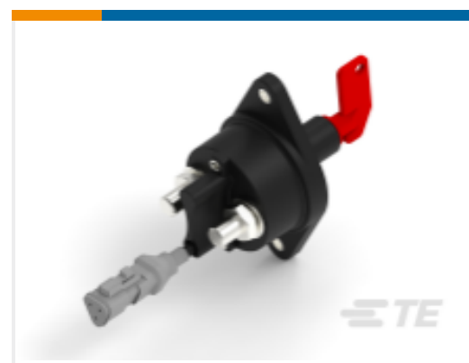
TE Part # CAT-AL4-SBD355001 Battery Disconnecter, 500A, 1 Pole