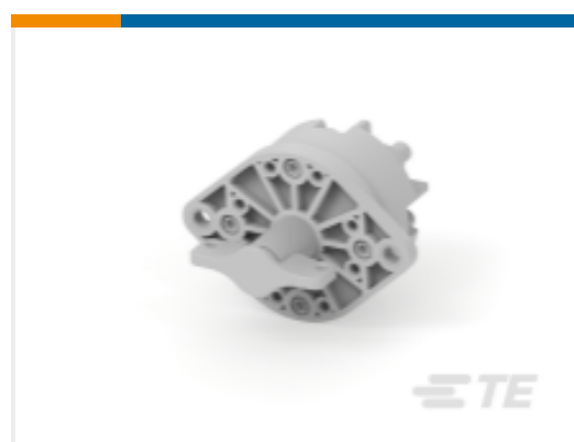
TE Part # K1162859 Battery Disconnecter 35-524-130-S