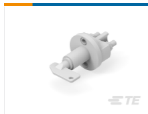
TE Part # K1060773 Battery Disconnecter 35-205