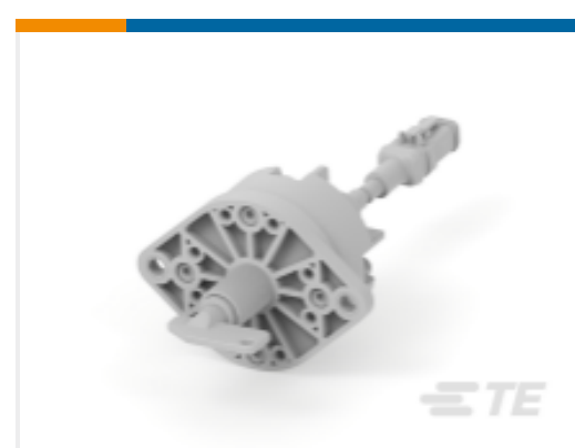
TE Part # K1166380 Battery disconnecter 35-524-101-R-A2