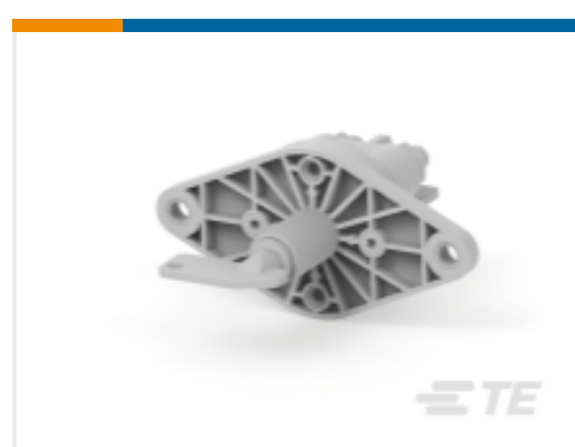
TE Part # K1158975 Battery Disconnecter 35-225-100-R-901