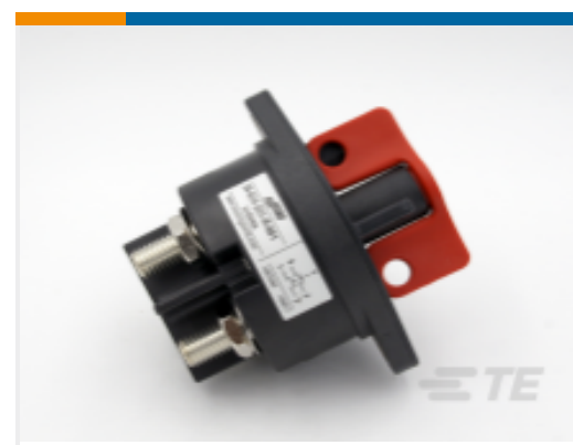
TE Part # CAT-AL4-SBD355002 Battery Disconnecter, 500A, 2 Pole