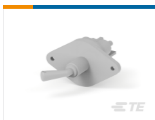
TE Part # K1162508 Battery Disconnecter 35-221-020-S