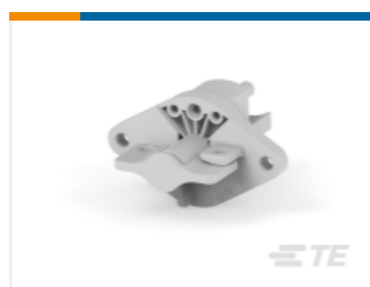
TE Part # K1137201 Battery Disconnecter 35-414-131-GE- 900