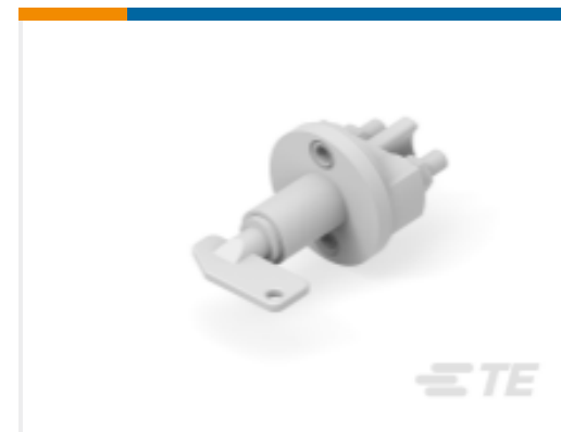
TE Part # K1060773 Battery Disconnecter 35-205