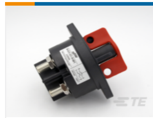
TE Part # CAT-AL4-SBD355002 Battery Disconnecter, 500A, 2 Pole