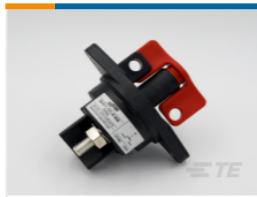
TE Part # CAT-AL4-SBD353001 Battery Disconnecter, 300A, 1 Pole