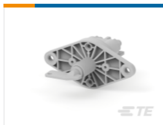
TE Part # K1158975 Battery Disconnecter 35-225-100-R-901