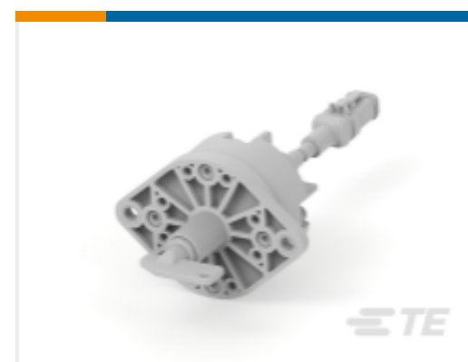
TE Part # K1166380 Battery disconnecter 35-524-101-R-A2