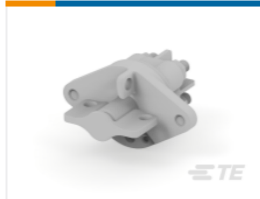
TE Part # CAT-AL4-SBD352002 Battery Disconnecter, 200A, 2 Pole