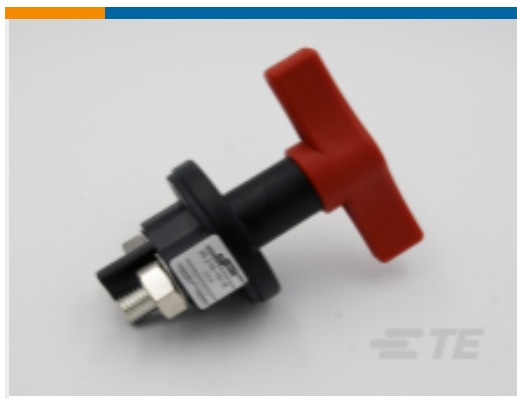
TE Part # CAT-AL4-SBD352001 Battery Disconnecter, 200A, 1 Pole