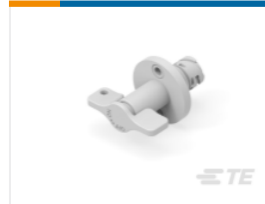
TE Part # K1156093 Batteriesignalschalter 35-0010-B30-R