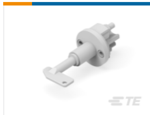
TE Part # K1060598 Battery Disconnecter 35-203