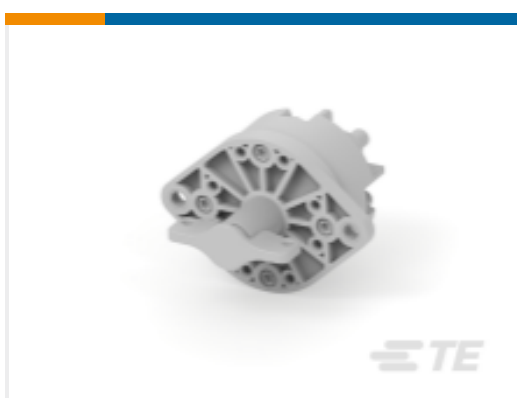
TE Part # K1162859 Battery Disconnecter 35-524-130-S