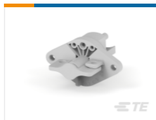
TE Part # K1137201 Battery Disconnecter 35-414-131-GE-900