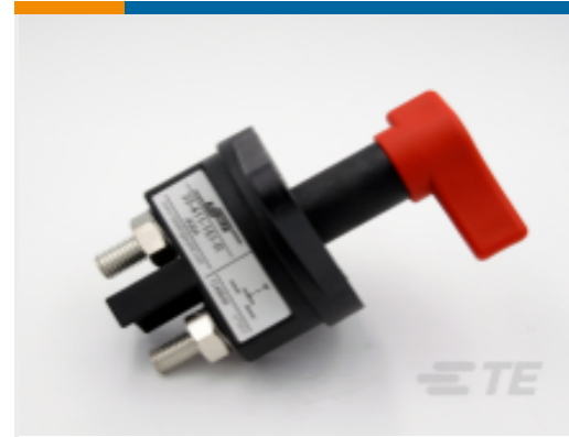
TE Part # CAT-AL4-SBD354001 Battery Disconnecter, 400A, 1 Pole