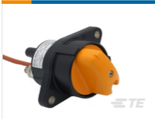
TE Part # CAT-AL4-HVBDS High Voltage Battery Disconnect Switches