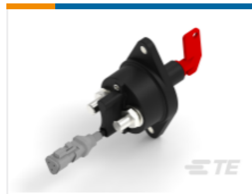
TE Part # CAT-AL4-SBD355001 Battery Disconnecter, 500A, 1 Pole