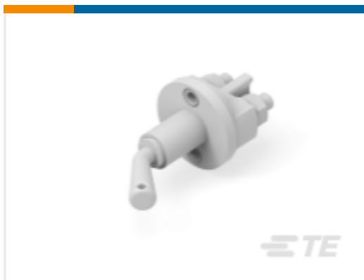
TE Part # K1060469 Battery Disconnecter 35-201