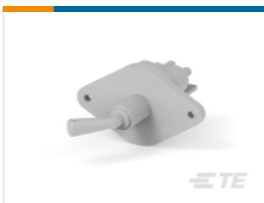
TE Part # K1162508 Battery Disconnecter 35-221-020-S