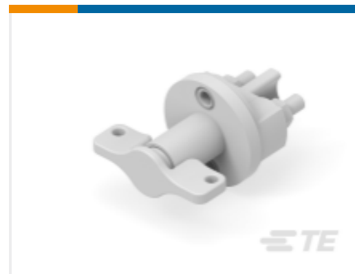
TE Part # K1060772 Battery Disconnecter 35-204