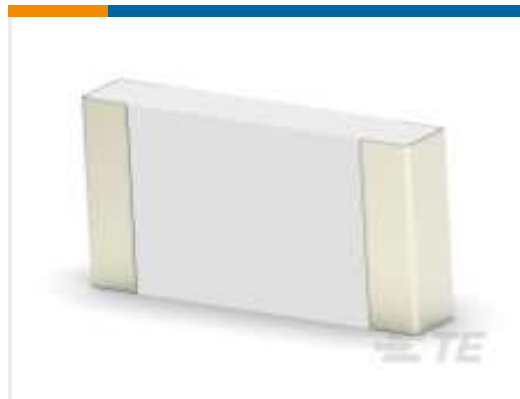
TE Part #2-2176245-2 CRGS1206 5% 56R