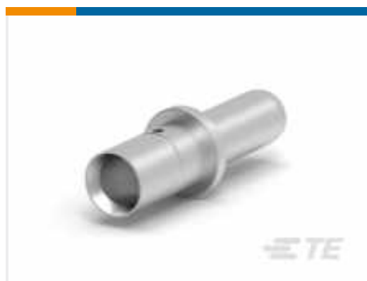
TE Part #SRK-PC-080-25-601 PIN, SOLID, SIZE M8, 25mm2, AG