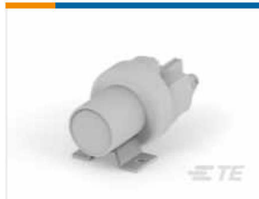
TE Part #K1008699 Relay 26-60-05