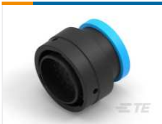
TE Part #YHDP26-24-35PEL017 PLG, 35P, BLK, E, RNG, 16/20, P