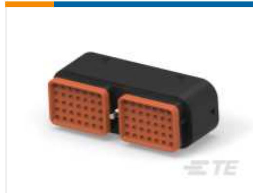
TE Part #DRC16-70SBE-P013UK PLG, 70P, BLK, E, SEAL BOND, B