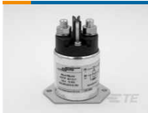
TE Part #K1060489 Relay 29-113-12