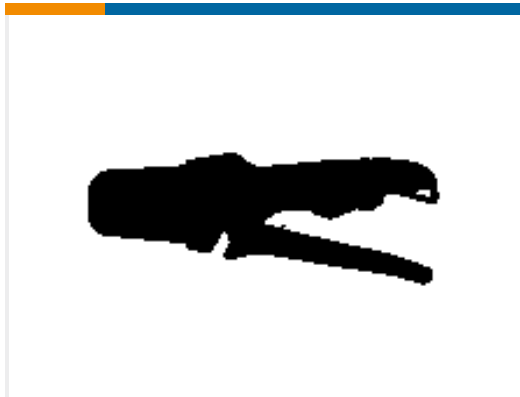
TE Part #DTT-20-03 CRIMP TOOL