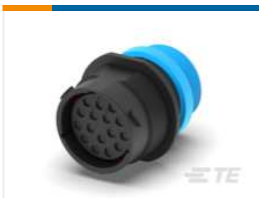
TE Part #HDP24-24-16SE-L015 REC, 16P, BLK, E, THD, 12, S