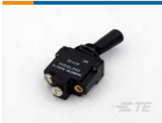
TE Part #K1007153 Toggle Switch 08-1-1-13