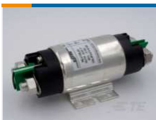
TE Part # CAT-AL6-KSPR29300 Power Relay, 300A, Standard, Monostable, DC