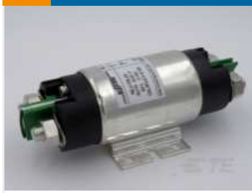
TE Part #K1021362 Relay 29-321-11