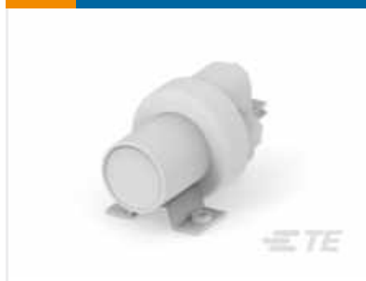
TE Part #K1060617 Relay 26-57-08