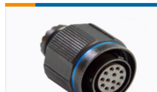
TE Part #YDTS26Z19-35PNV001 PLUG ASSY