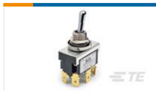
TE Part #1-6437630-1 AWTS1504