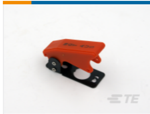
TE Part # K1127139 Switch guard 07-0-0-30