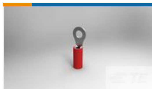
TE Part #8-36150-1 PIDG R 22-16 COMM 22-18 MIL 6