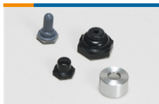
Switch Seals & Accessories(18)