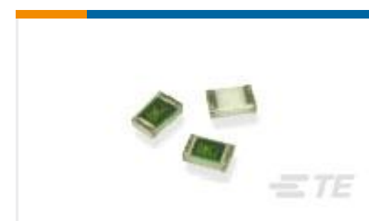
TE Part #1676305-3 RN 0805 32K4 0.1% 10PPM 5KRL