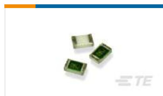
TE Part #4-1614881-3 CPF 0603 20R 0.1% 25PPM 5K RL