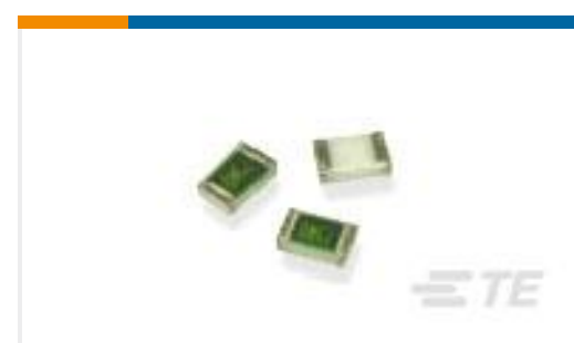
TE Part #1676377-2 RN 0805 56K2 0.1% 10PPM 1KRL