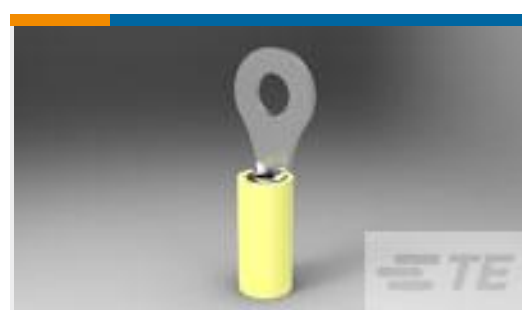
TE Part #323915 TERMINAL,PIDG R 26-22 6