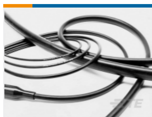
TE Part #CB03334007 Single Heavy Wall RW 200 E: Heat Shrink Tubing, 2:1 Shrink Ratio