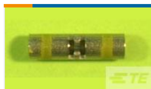
TE Part #680333-000 D-609-13