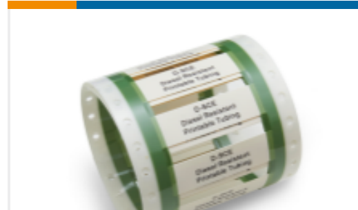
TE Part #919385-000 D-SCE Fluid Resistant Sleeves