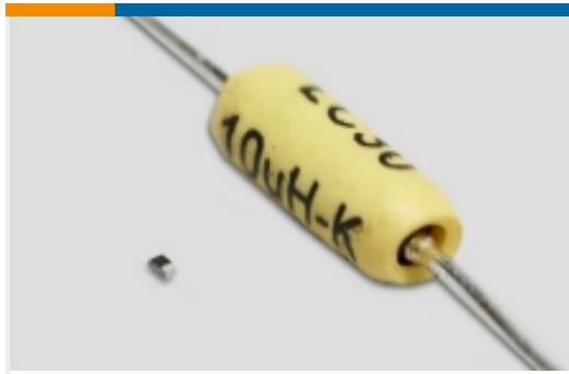
High Frequency & RF Inductors(82)