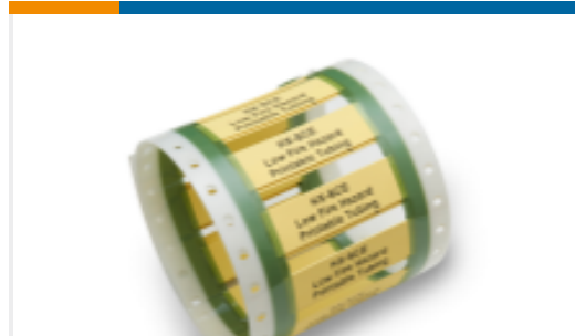
TE Part #D15532-000 HX-SCE Low Fire Hazard Sleeves