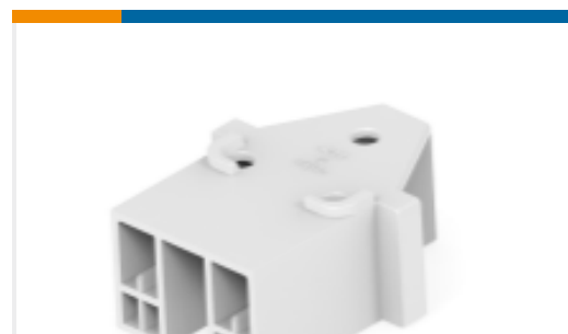
TE Part #2426423-1 2.29 DIA CLUSTER BLOCK HOUSING RECEPTACLE