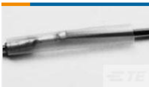
TE Part #CV3304-000 RW-175-1/4-X-STK