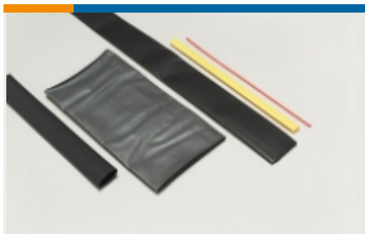
Heat Shrink Tubing(66)