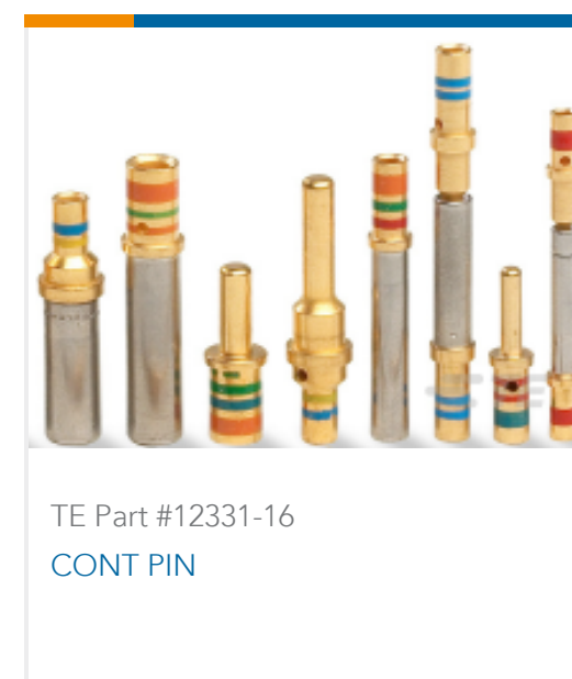
TE Part #12331-16 CONT PIN