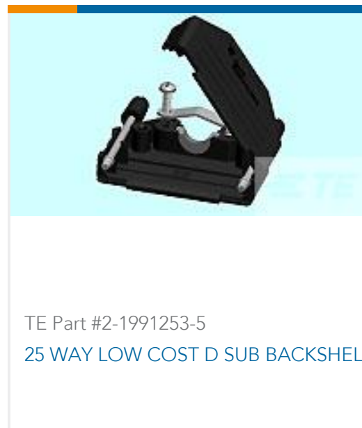
TE Part #2-1991253-5 25 WAY LOW COST D SUB BACKSHEL