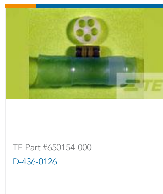
TE Part #650154-000 D-436-0126