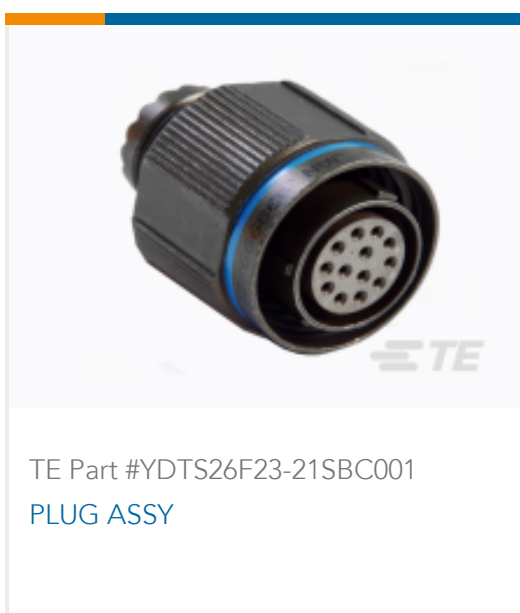
TE Part #YDTS26F23-21SBC001 PLUG ASSY