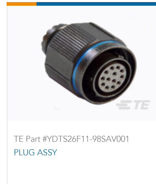
TE Part #YDTS26F11-98SAV001 PLUG ASSY