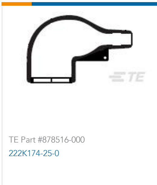
TE Part #878516-000 222K174-25-0