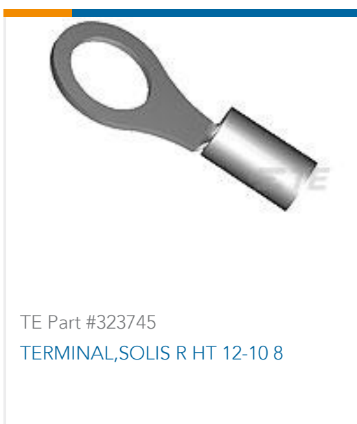
TE Part #323745 TERMINAL,SOLIS R HT 12-10 8