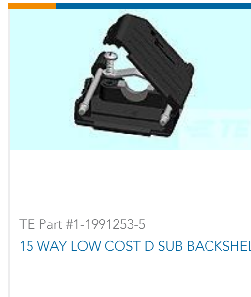
TE Part #1-1991253-5 15 WAY LOW COST D SUB BACKSHEL