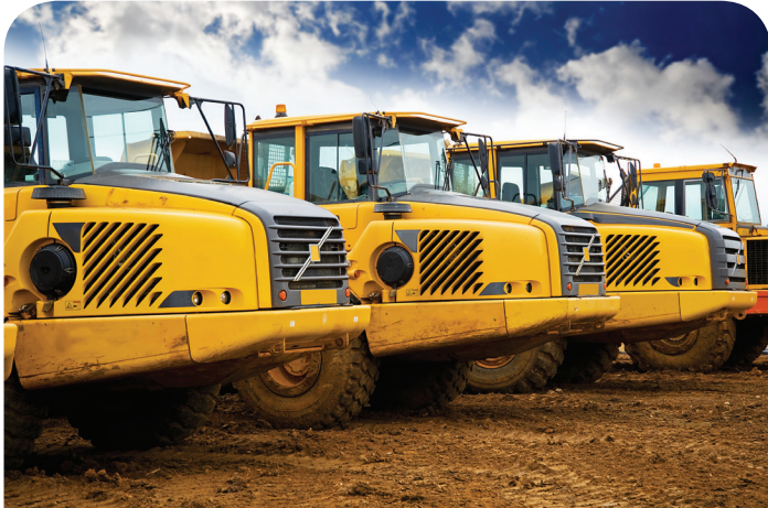
Hydraulic and braking systems