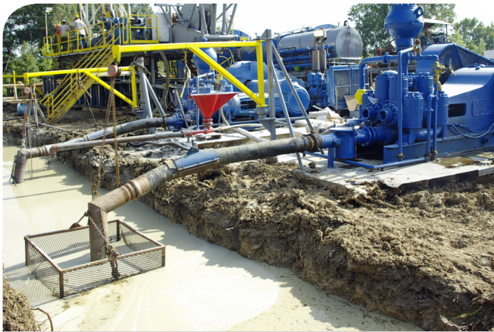
Mud pump line pressure measurement