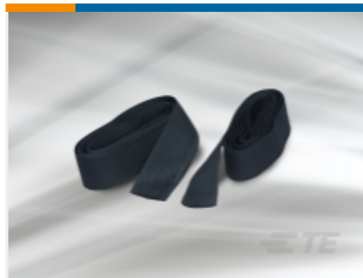
TE Part #2065124003 HFT5000 Heat Shrink Tubing