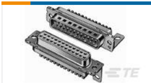
TE Part #8-1393480-5 V23529B1223C209=SUB D STIFTLI