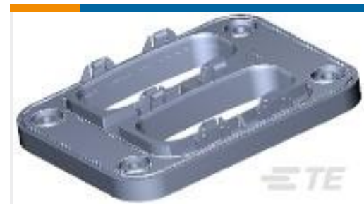
TE Part #1813123-1 ASSY FOR SUPPORT PLATE AND SEALING