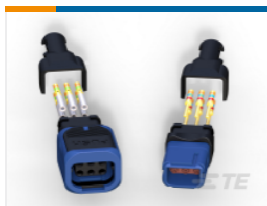
TE Part #YD369-R99-NS300000 369 9 WAY REC, 20/22 CONTACTS, SKT