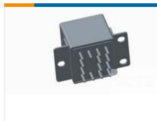
TE Part #9-1617806-4 TD231-3002P=TDAR 3-30SEC M83726 /31-3002P