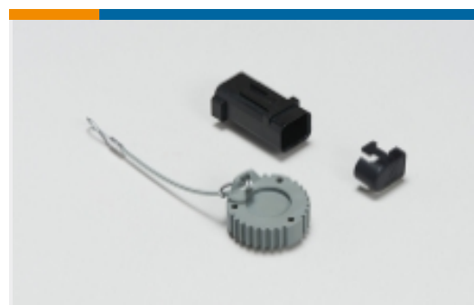
Automotive Connector Caps & Covers (32)