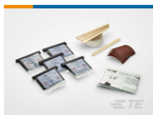
TE Part # 878462-000 S1125-KIT-1