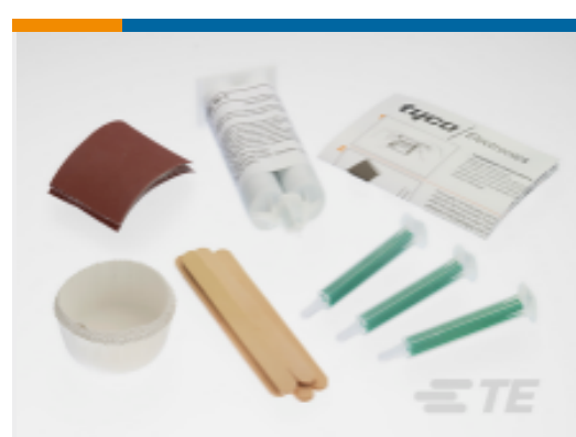
TE Part # 657863-000 S1125-KIT-4