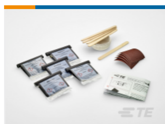
TE Part # 931156-000 S1125-KIT-4