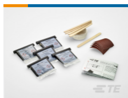
TE Part # 583393-000 S1125-KIT-5