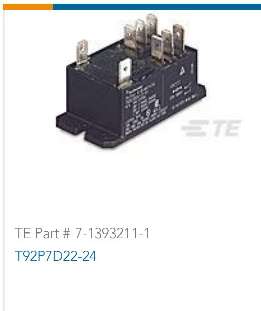
TE Part # 7-1393211-1 T92P7D22-24