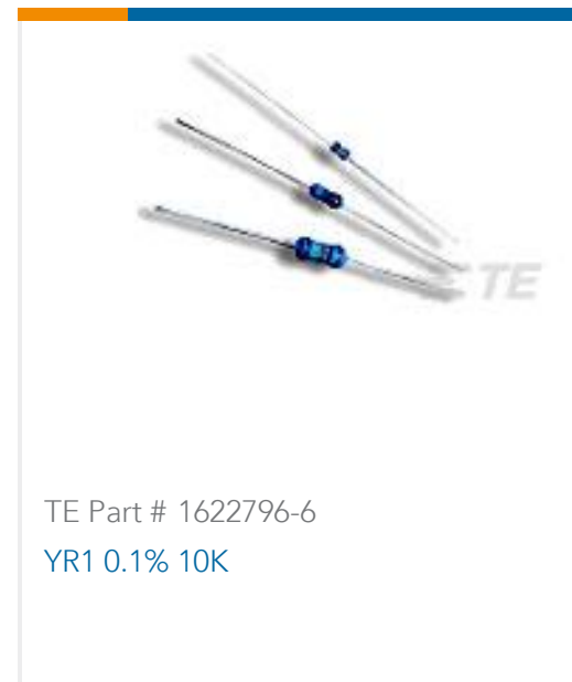
TE Part # 1622796-6 YR1 0.1% 10K