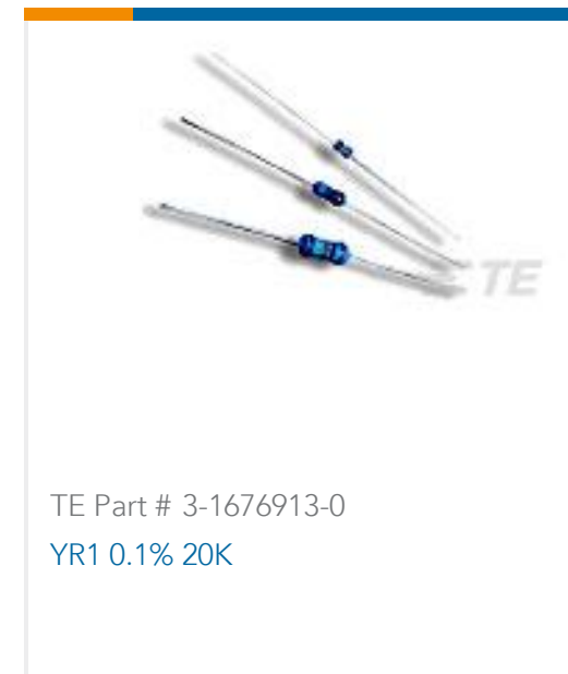
TE Part # 3-1676913-0 YR1 0.1% 20K