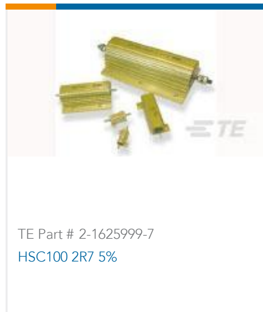
TE Part # 2-1625999-7 HSC100 2R7 5%