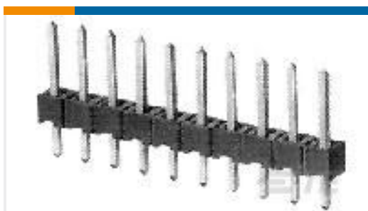
TE Part #1-826648-4 14P AMPMODU II STIFT LEI