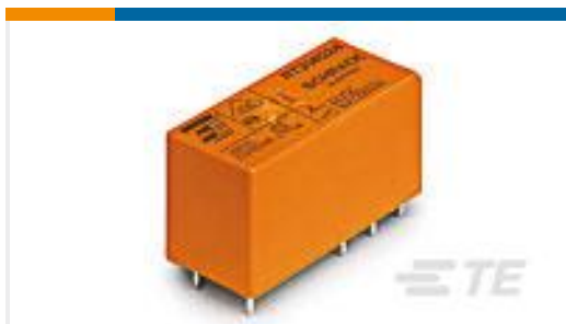
TE Part #9-1393239-5 RT314012