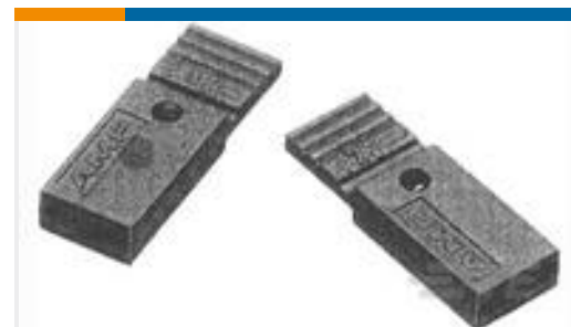
TE Part #881545-1 SHUNT LP W/HANDLE 2POS 15AU