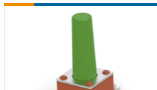
TE Part #2-1977223-8 FSM14JSMAS=6MM TACT SWITCH, SMT 160gf