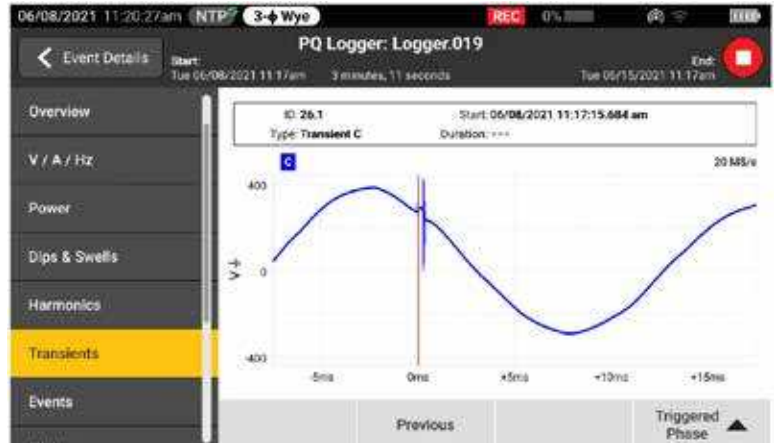
View real-time voltage transitory events while logging for faster troubleshooting

Transients negatively impact otherwise healthy systems every day and their potential to damage your equipment can't be underestimated. Whether your system is experiencing impulsive or oscillatory transients, the results can be devastating and cause problems ranging from insulation failures to total equipment failures. The Fluke 1775 and Fluke 1777 incorporate advanced transient capture technology to help you clearly identify high-speed voltage transients, so you have the data you need to stop them in their tracks. The Fluke 1775 Power Quality Analyzer has 1MHz sampling capability to capture fast transients, while the Fluke 1777 Power Quality Analyzer has 20MHz sampling capability to capture the fastest transients in high detail.