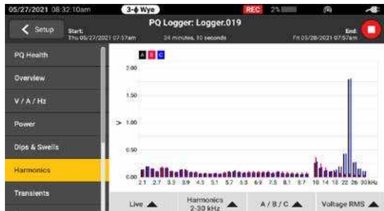
A full range of harmonics are available from the first 50 integer harmonics and from 2 kHz to 30 kHz

The Fluke 1770 Series was designed to be safe and easy to use in any measurement environment. The 1770 Series allows you to capture a full range of power quality variables as well as high-speed waveforms, high-speed transients, and higher frequency harmonics, all of which are instantly viewable on the large, high-resolution screen. With a best-in-class CAT IV 600 V / CAT III 1000 V overvoltage rating, these analyzers can be used at the service entrance or downstream, measuring AC and DC inputs, and harmonics measuring up to 30 kHz. With the 1770 Series you can be confident that you'll capture the data you need to make better maintenance decisions no matter the task.