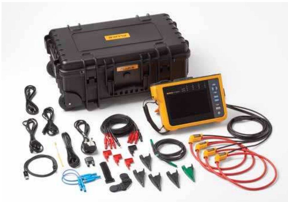
Fluke 1777 Power Quality Analyzer. Note: Included items vary by model and are listed in the “Ordering information” table.