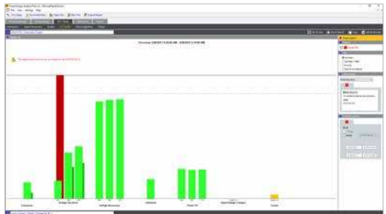
Fluke Energy Analyze Plus: Power quality health summary