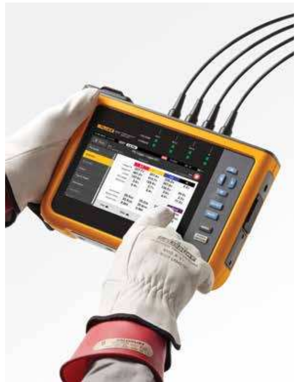
Easily navigate using the large color touchscreen

When downloading data from the Fluke 1770 Series Power Quality Analyzers the included Energy Analyze Plus software package can compare measured voltage and current harmonic statistical data to different standards, like EN 50160 or IEEE 519, to determine if they exceed compliance limits. This powerful predictive maintenance feature enables current harmonics to be observed before distortion appears in the voltage allowing you to prevent unexpected failures or non-compliance situations and increase system uptime. With the proliferation of inverter-based loads and power generation, keeping current harmonics in check is becoming increasingly critical to ensure reliable power quality and avoid system downtime.