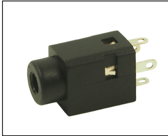
Part No. FC681374V