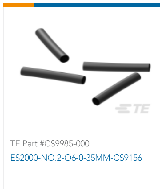
TE Part #CS9985-000 ES2000-NO.2-O6-0-35MM-CS9156