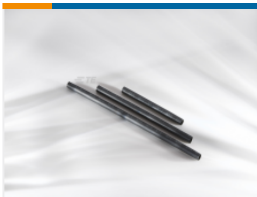
TE Part #537637P056 SCT Heat Shrink Tubing