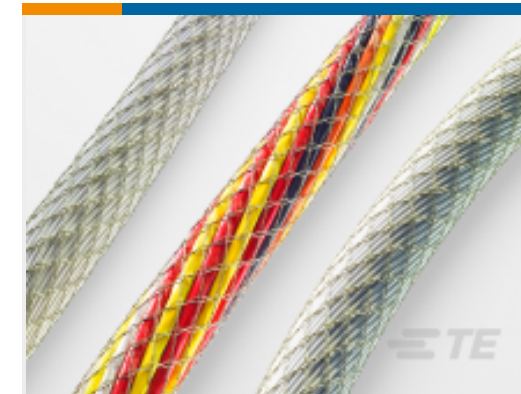
TE Part # EG1595-000 CBMS-10-P