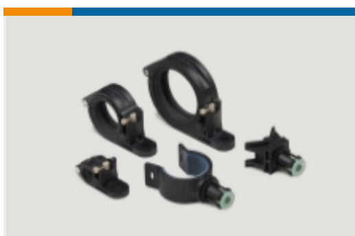
Cable Mounting & Harness Accessories (10)