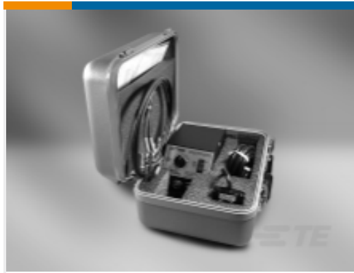
TE Part # 173643-000 RH-3960-1-TINEL-KIT-120V