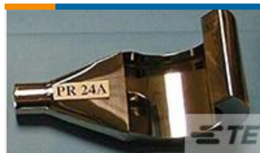
TE Part #991989-000 PR-24A-REFLECTOR