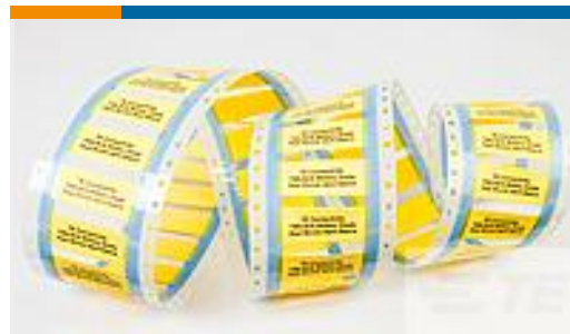
TE Part #5332610001 TMS-SCE-3/16-2-0-4