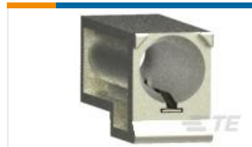
TE Part #1-1469492-9 MULTIGIG RT 9MM GUIDE/ESD UNKE