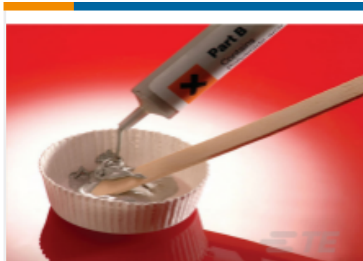
TE Part # 369276-000 S1184-KIT-1