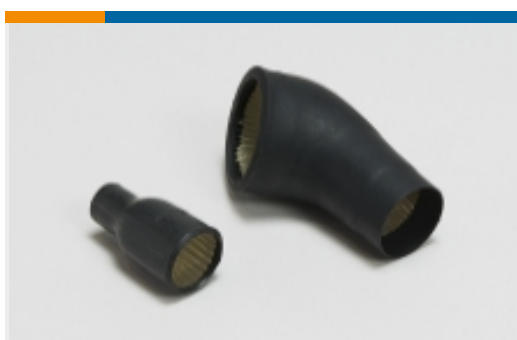
EMI Shielded Boots(80)