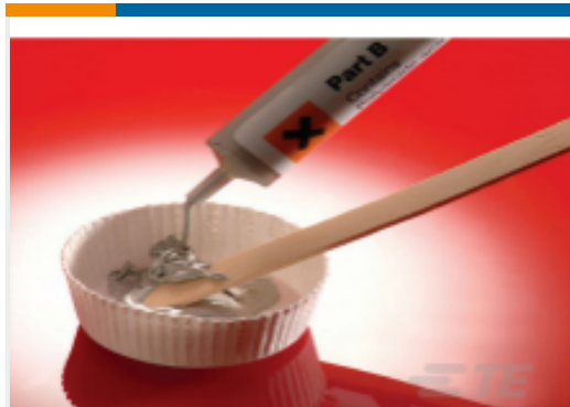
TE Part # 369276-000 S1184-KIT-1