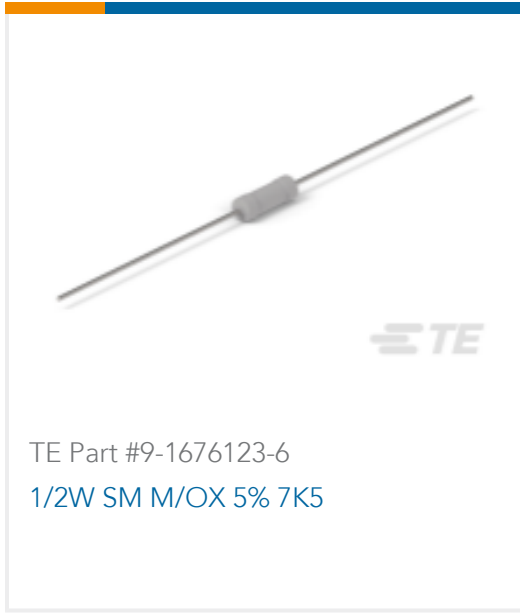
TE Part #9-1676123-6 1/2W SM M/OX 5% 7K5