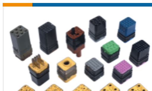
TE Part #ZPF30000000015262 DMC-M 12-20 BN