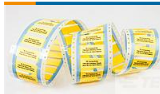
TE Part #6641710001 TMS-SCE-1/4-2.0-9