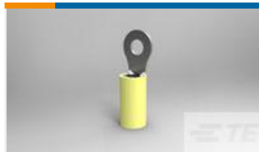
TE Part #320568 TERMINAL,PIDG R 12-10 8