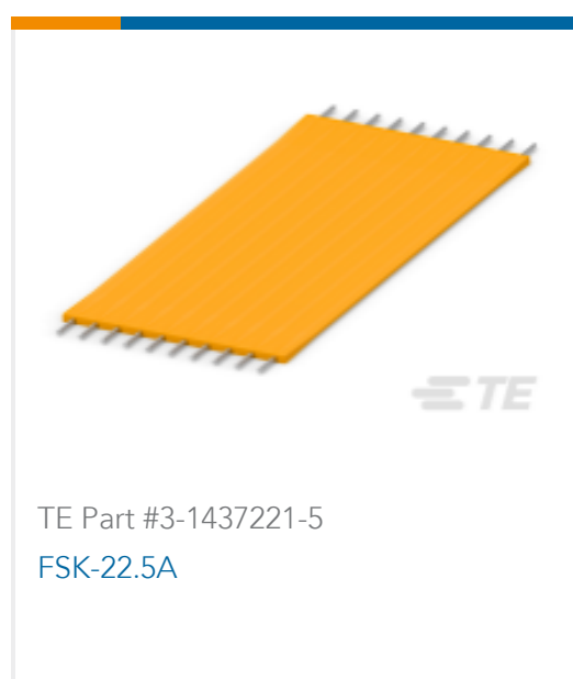
TE Part #3-1437221-5 FSK-22.5A