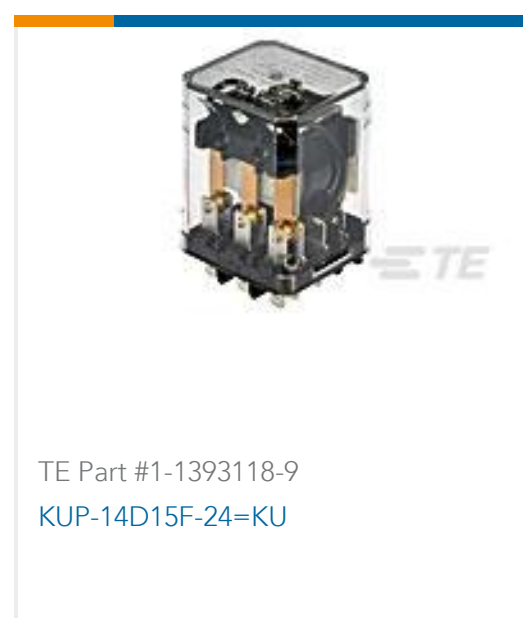
TE Part #1-1393118-9 KUP-14D15F-24=KU