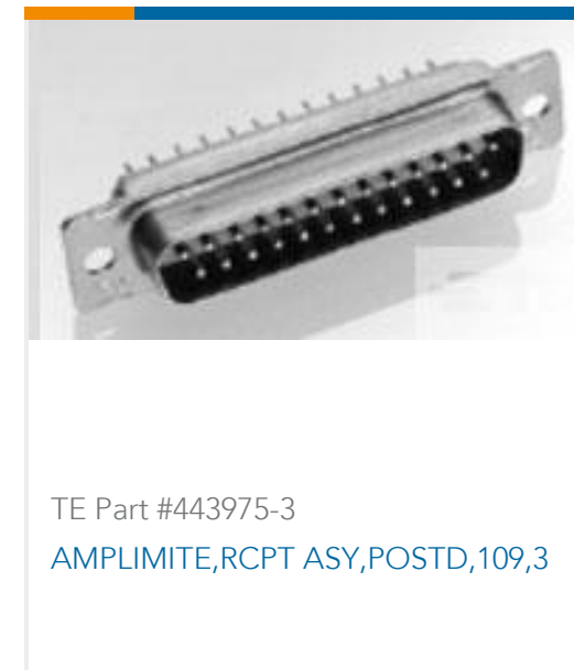
TE Part #443975-3 AMPLIMITE,RCPT ASY,POSTD,109,3