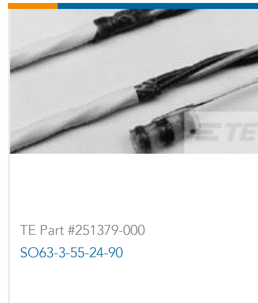
TE Part #251379-000 SO63-3-55-24-90