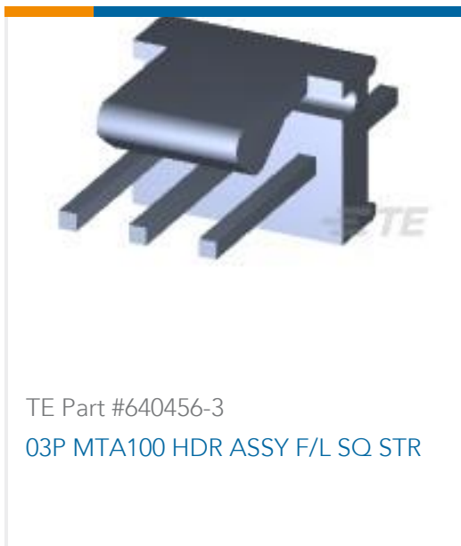
TE Part #640456-3 03P MTA100 HDR ASSY F/L SQ STR