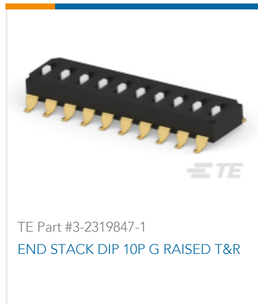
TE Part #3-2319847-1 END STACK DIP 10P G RAISED T&R