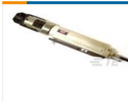
TE Part #679304-1 PNEUMATIC HEAD ASSEMBLY