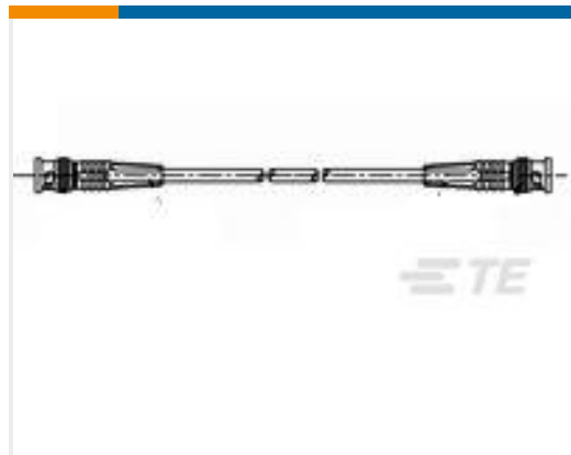
TE Part #1337771-8 50 OHM COAX BNC STR PLUG P99-E