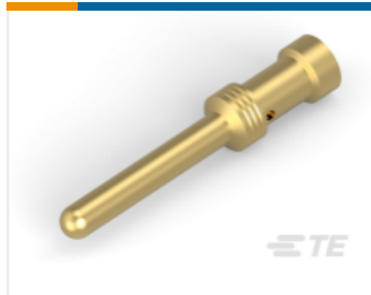
TE Part #T2030011025-000 DEM-2.5