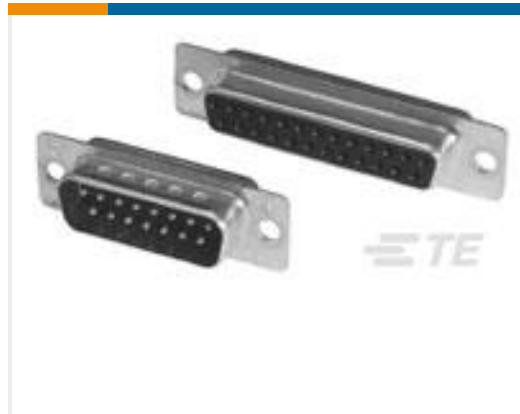
TE Part #4-1393483-8 V42254A1115C215=SUB D STIFTLER