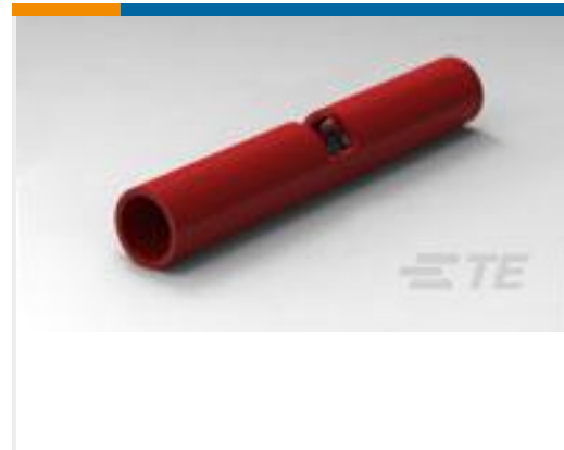
TE Part #320559 PIDG SPLICE 22-16COMM 22-18MIL