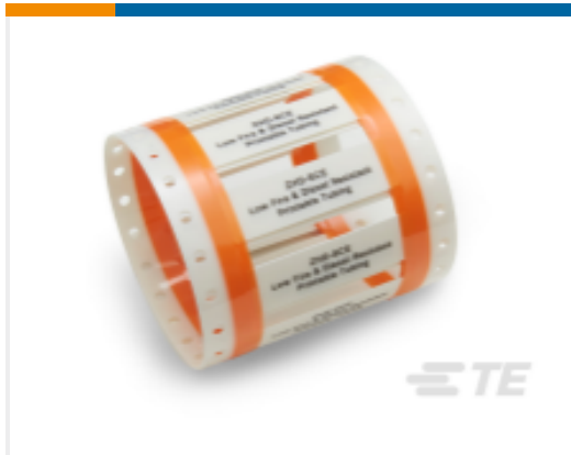
TE Part #EC9884-000 Fluid Resistant Sleeves, ZHD-SCE