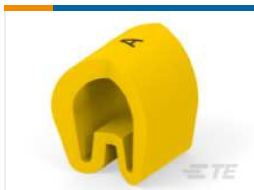
TE Part # EC5805-000 11561410