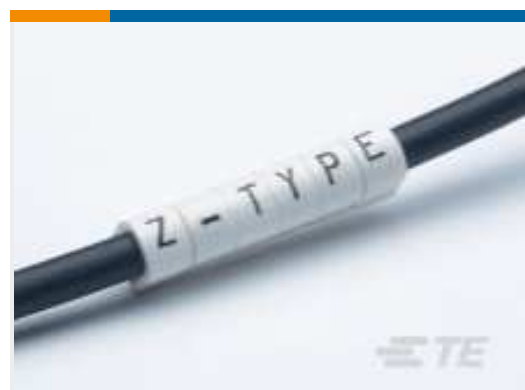
TE Part # CAT-T3437-Z1 Z-Type Push-On Markers