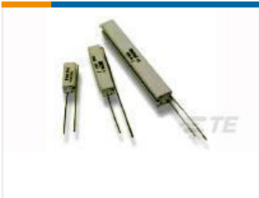
TE Part #1-1623728-1 BCHE 11 W 220R 5%