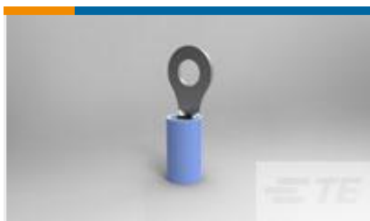
TE Part #51864-1 TERM, RT, PIDG, 16-14, #8