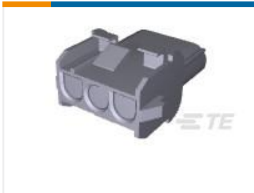
TE Part #350767-1 03P UMNL CAP HSG V0