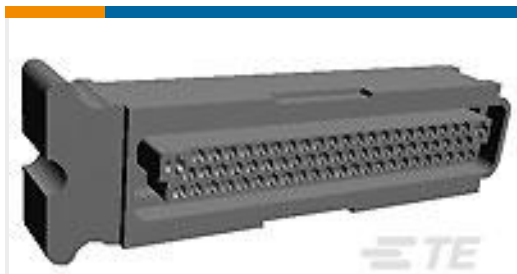
TE Part #963598-1 MICRO-T/JPT GH66/2P