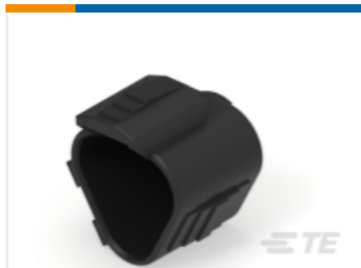
TE Part #1011-345-0305 DUST CAP, 3P, PLG, BLK, DT