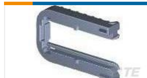
TE Part #1564411-1 SLIDE,TAB HSG GROUP E