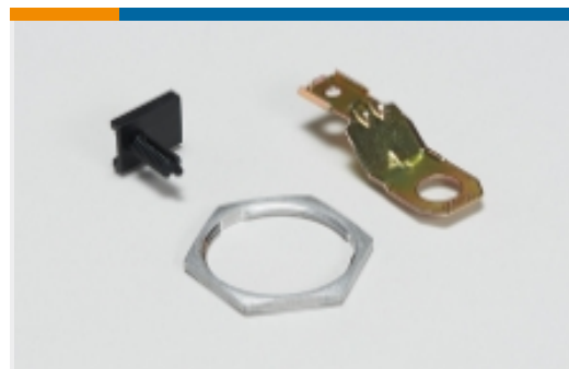
Other Automotive Connector Accessories(13)