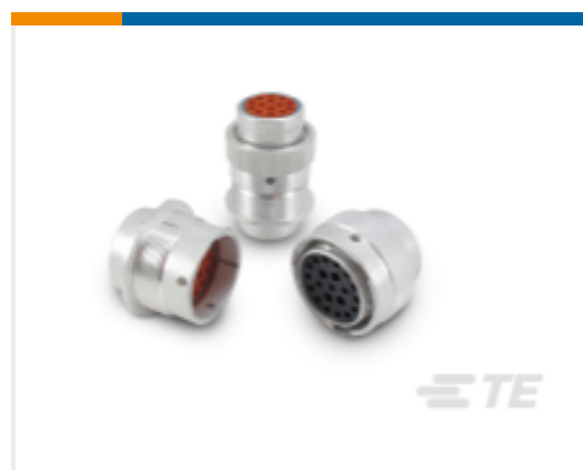
TE Part #HD34-18-21PN DEUTSCH HD30 HOUSINGS