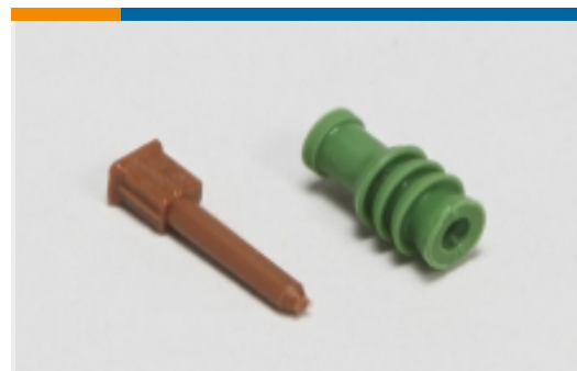
Automotive Seals & Cavity Plugs(4)