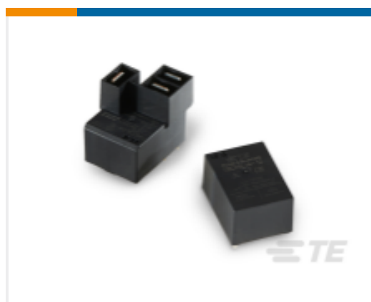
TE Part #1558661-7 PCB Power Relay: 30 amp, Monostable DC