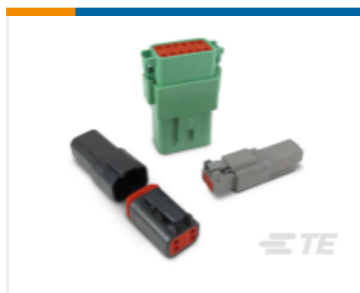
TE Part #DT04-12PA-L012 DEUTSCH DT HOUSINGS