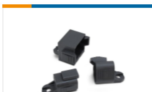
TE Part #DT4P-DC DEUTSCH DT DUST CAPS