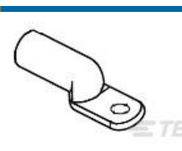
TE Part #277149-3 TERMINAL,COPALUM R 4 5/16