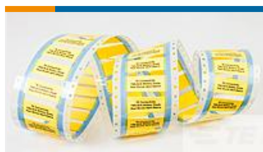
TE Part #4554650001 TMS-SCE-1K-1/8-2.0-9