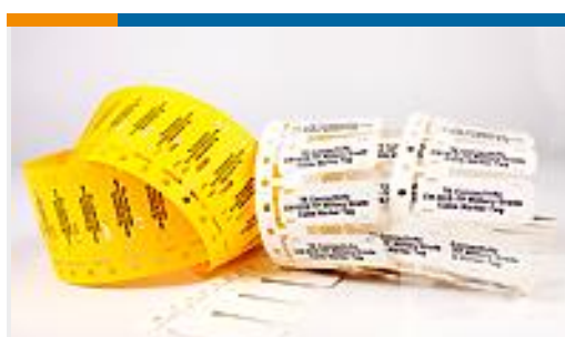
TE Part #A83925-000 CM-SCE-TP-1/2-6H-9