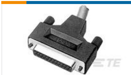
TE Part #1-747943-6 KIT,RCPT,9P,HDE,SHLD ENCLSR