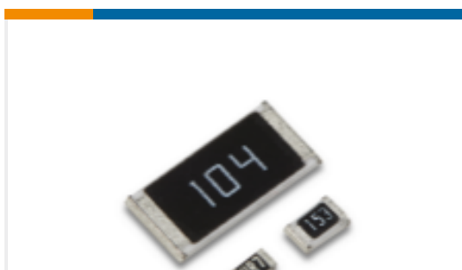
TE Part #1-2176345-6 CRGCQ 1210 180R 1%