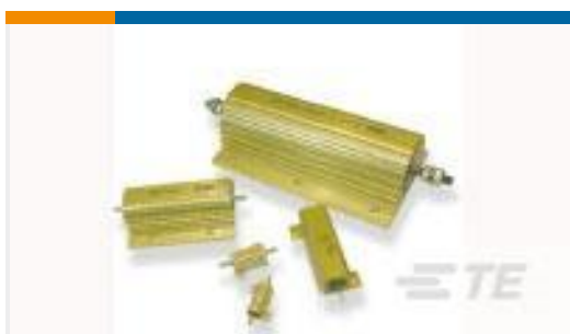
TE Part #1625999-3 HSC100 10R 5%