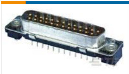
TE Part #1-5747872-6 15 PLUG SP/FMS INSRT