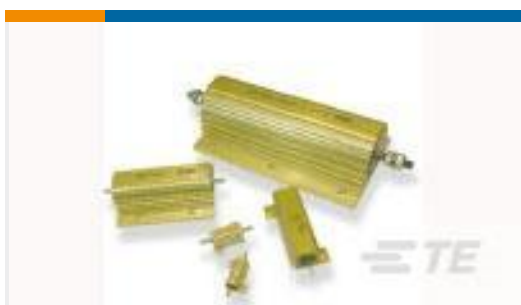
TE Part #6-1625963-7 HSA5 1R2 5%