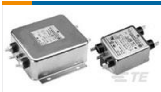
TE Part #6609042-1 3VS1=F7246 S0