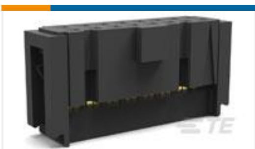
TE Part #2-1658527-0 622-1230LF=FSKT IDC S 12 30AU