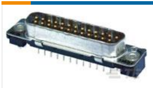
TE Part #5745968-7 25 PLUG SP/FMS INSRT