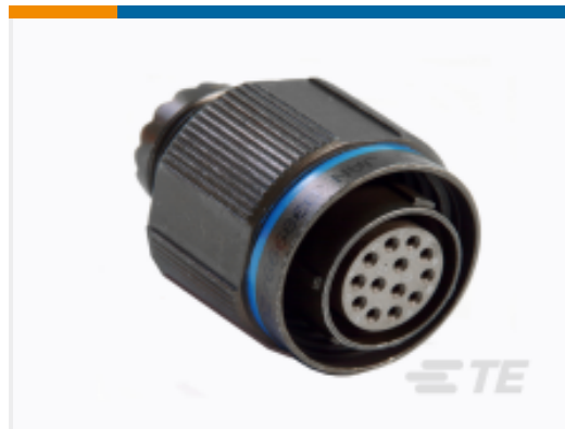
TE Part #YDTS26Z13-35PAV001 PLUG ASSY