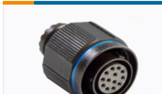
TE Part #YDTS26Z17-26PAV001 PLUG ASSY