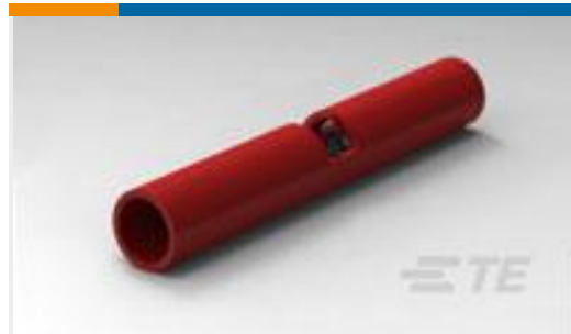
TE Part #2-320559-4 SPLICE BUTT PIDG 22-16; TAPE