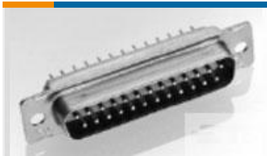
TE Part #205485-2 AMPLIMITE,ASY,RCPT,FB,109,4,CONT