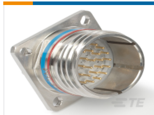
TE Part # CAT-D38999-DTS8L D38999: Square Flange, 15-19 insert