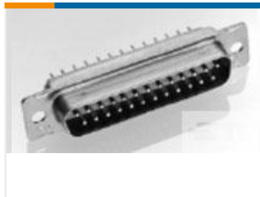
TE Part #204517-3 AMPLIMITE,ASY,PLUG,STD,90,3,KIT