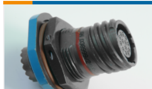
TE Part #YDTS24W17-35ANV001 RECP ASSY