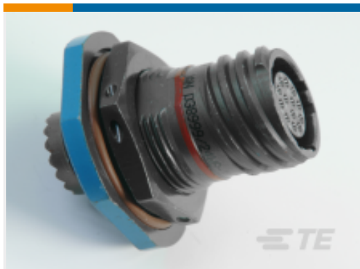
TE Part # CAT-D38999-DTS16Z Jam Nut: D38999, 15-19 Insert, Black Zinc Nickel Plating