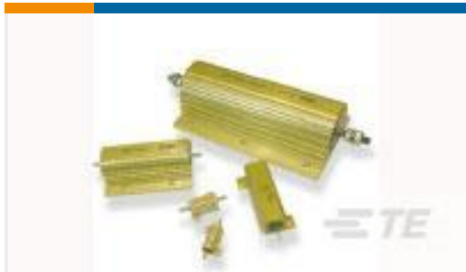
TE Part #2-1630027-9 HSC300 15R 5%