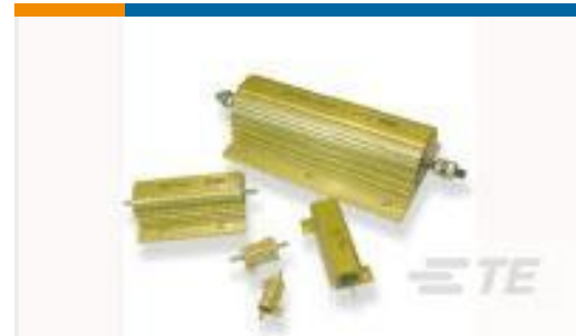
TE Part #3-1676625-3 HSA25 16R 1%