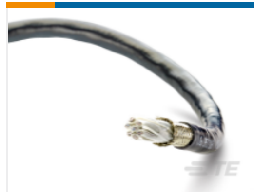
TE Part #8163673001 VG-95218-T025-G004