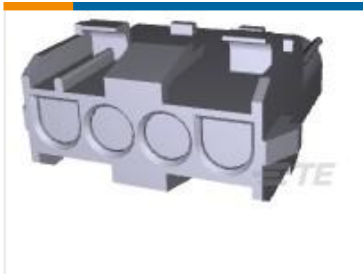
TE Part #926305-6 UNML4WAY CAP