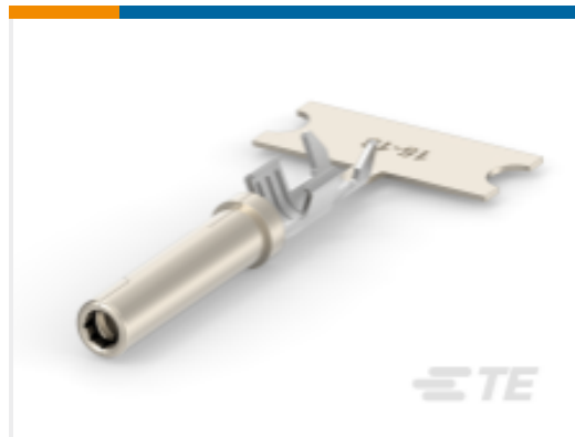
TE Part #2-2600021-3 XRC SOCKET 14-18 AWG Ni Plated