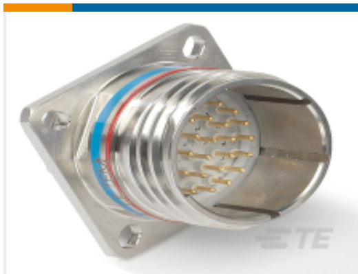
TE Part # YDTS20W21-39PAC001 RECP ASSY