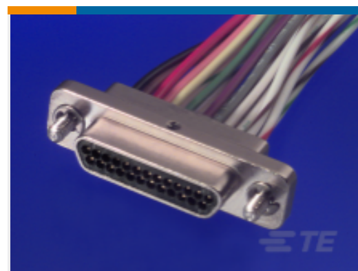
TE Part #2-1532171-5 M83513/04-A09C, MCKS-C2-B-9S6Q1-18.0