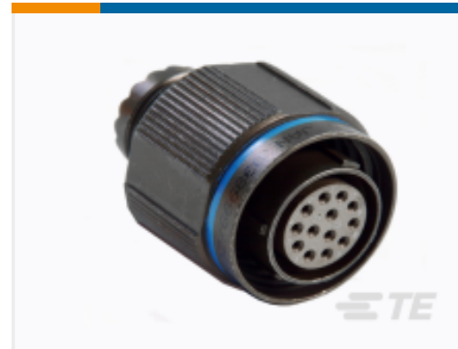
TE Part #YDTS26W09-98PNC001 PLUG ASSY