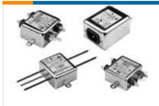
TE Part #1-6609028-8 10VK6=F7356 S0