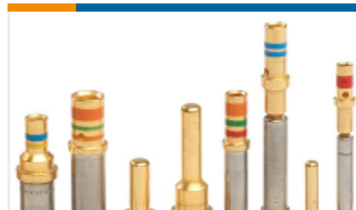
TE Part #ZPF000000000121738 182-0860-22