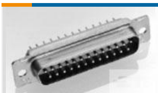
TE Part #204513-2 AMPLIMITE,ASY,PLUG,STD,90,1