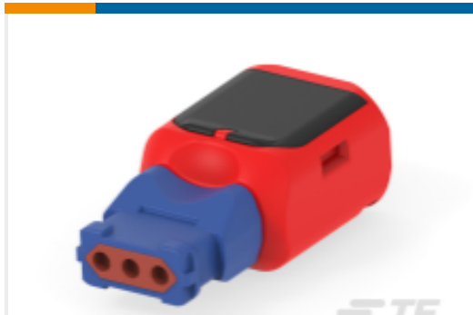
TE Part #D369-P33-NP0 Rectangular Connectors: 3-Way Plug