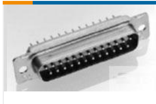
TE Part #204517-2 AMPLIMITE,ASY,PLUG,STD,90,3