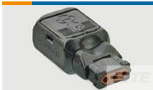
TE Part #D369-R33-BS0 369 3 WAY REC, NO CONTACTS, SKT