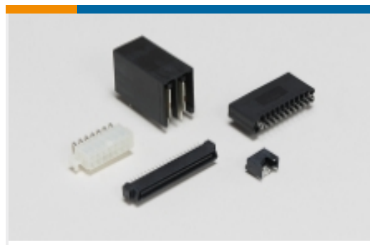
Standard Rectangular Connectors(403)