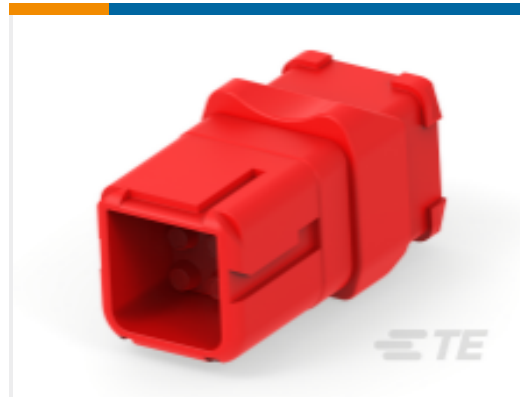
TE Part #D369-R99-NS0 Rectangular Connectors, 9 Way Receptacle