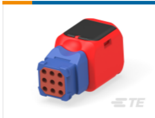
TE Part #D369-P99-NP0 Rectangular Connectors: 9-Way Plug