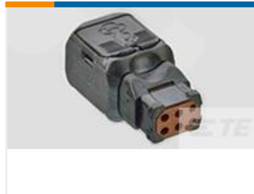
TE Part #D369-R66-BS0 369 6 WAY REC, NO CONTACTS, SKT