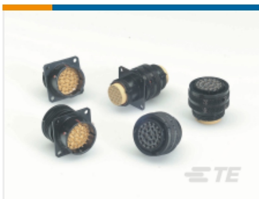
TE Part #ZPF000000000019909 FDDBA 57-14-15 SN-K-A499