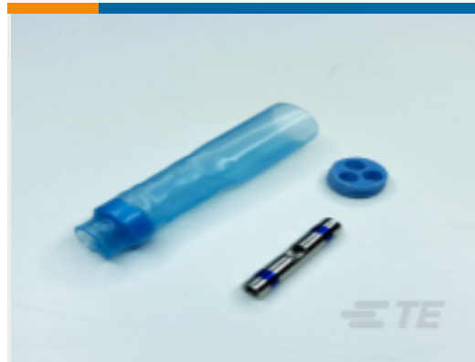
TE Part #CU3031-000 D-200-89