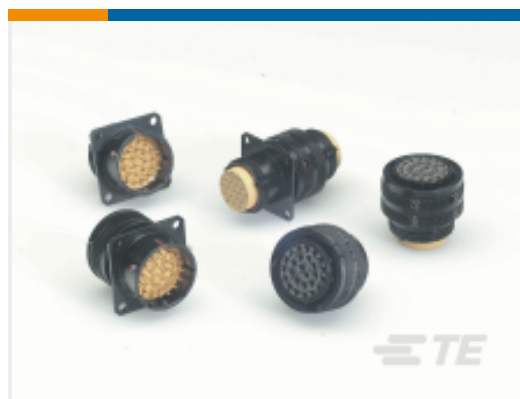
TE Part #ZPF000000000019919 FDDBA 57-14-19 PN-K-A499