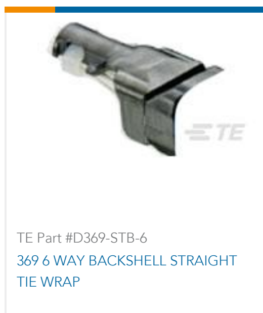
TE Part #D369-STB-6 369 6 WAY BACKSHELL STRAIGHT TIE WRAP