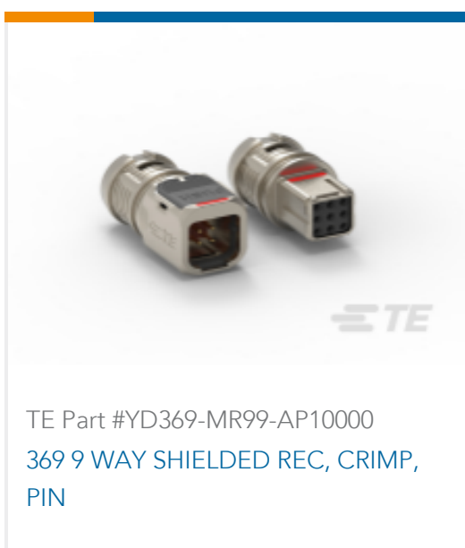
TE Part #YD369-MR99-AP10000 369 9 WAY SHIELDED REC, CRIMP, PIN