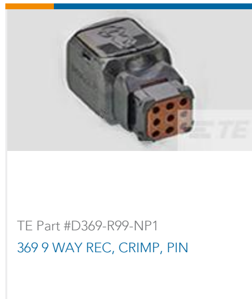
TE Part #D369-R99-NP1 369 9 WAY REC, CRIMP, PIN