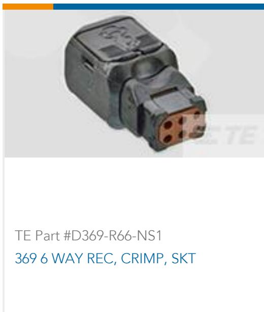
TE Part #D369-R66-NS1 369 6 WAY REC, CRIMP, SKT