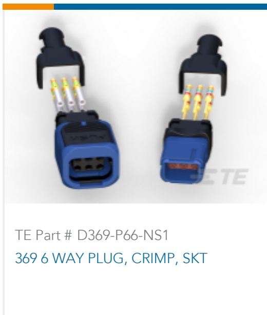
TE Part # D369-P66-NS1 369 6 WAY PLUG, CRIMP, SKT