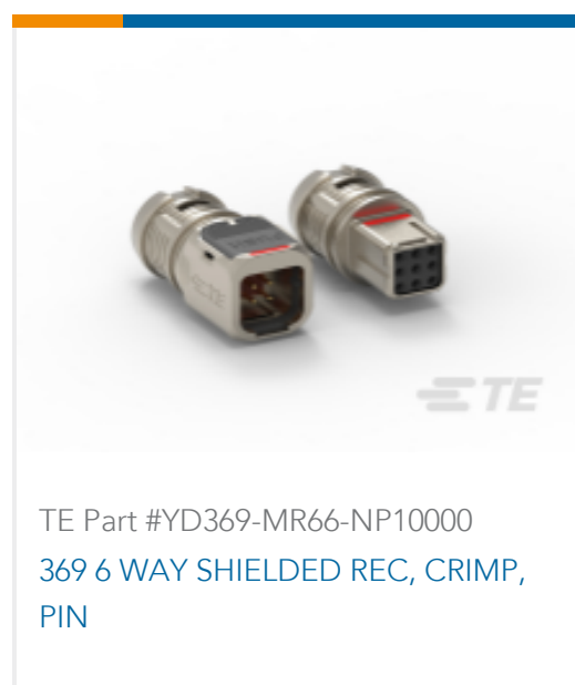
TE Part #YD369-MR66-NP10000 369 6 WAY SHIELDED REC, CRIMP, PIN